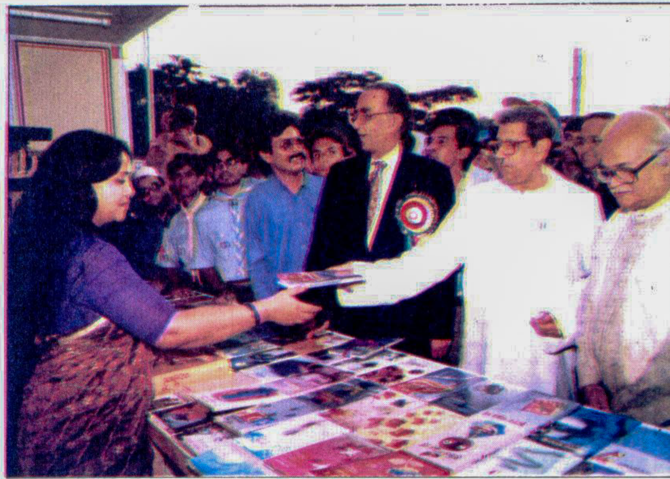
Justice Mohammed Habibur Rahman, former chief advisor in the caretaker government, visits a stall at the Fifth Dhaka Book Fair at Chandrima Uddyan in the city's Sher-e-Bangla Nagar yesterday.

Minister for Commerce and Industries Tofail Ahmed and British minister Dr Howells MP will jointly inaugurate the fair at Dhaka Sheraton Hotel.