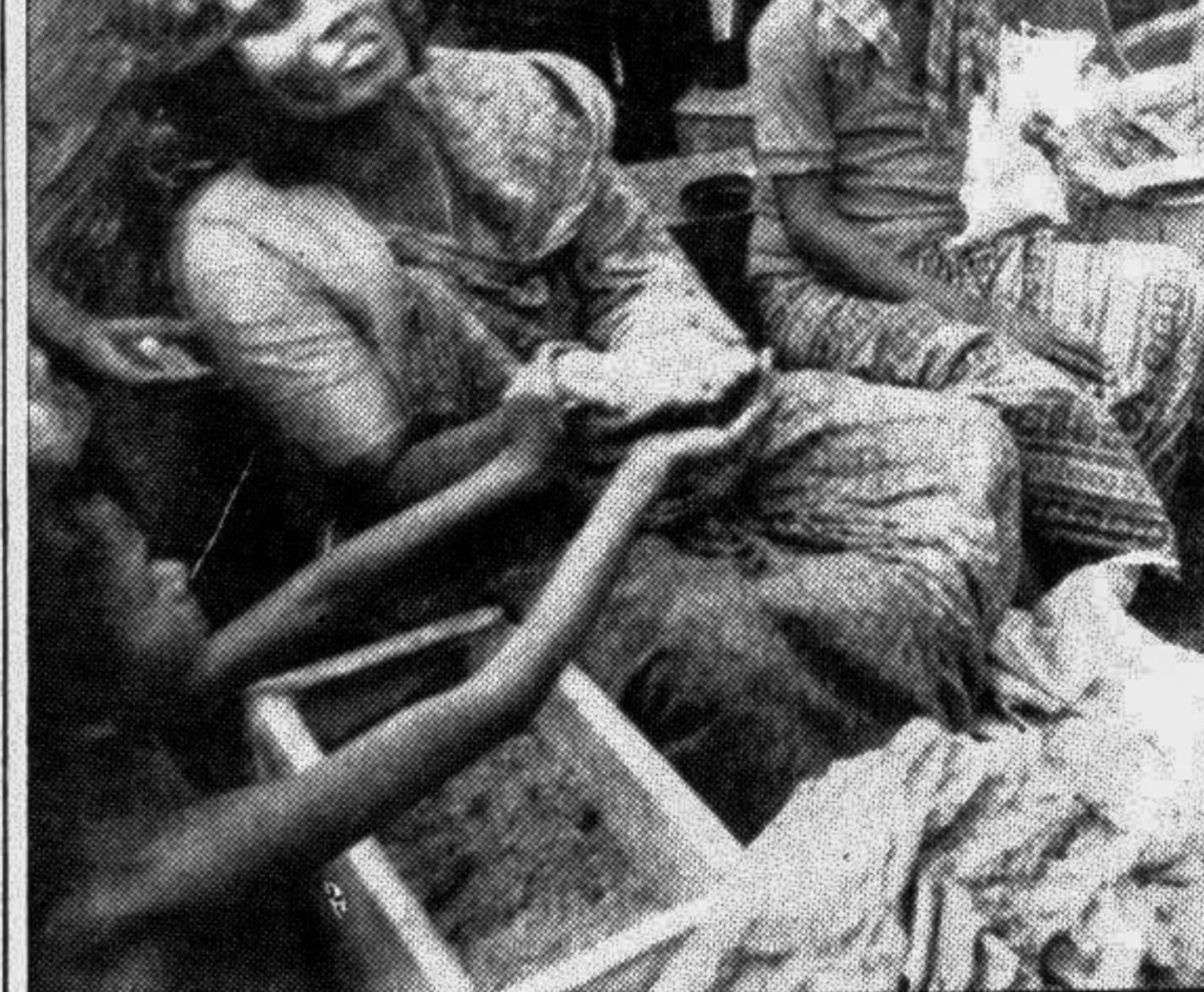
A distressed family sitting under open sky as their shanty was gutted in a blaze at Tikkapara slum in Kamalapur early yesterday.