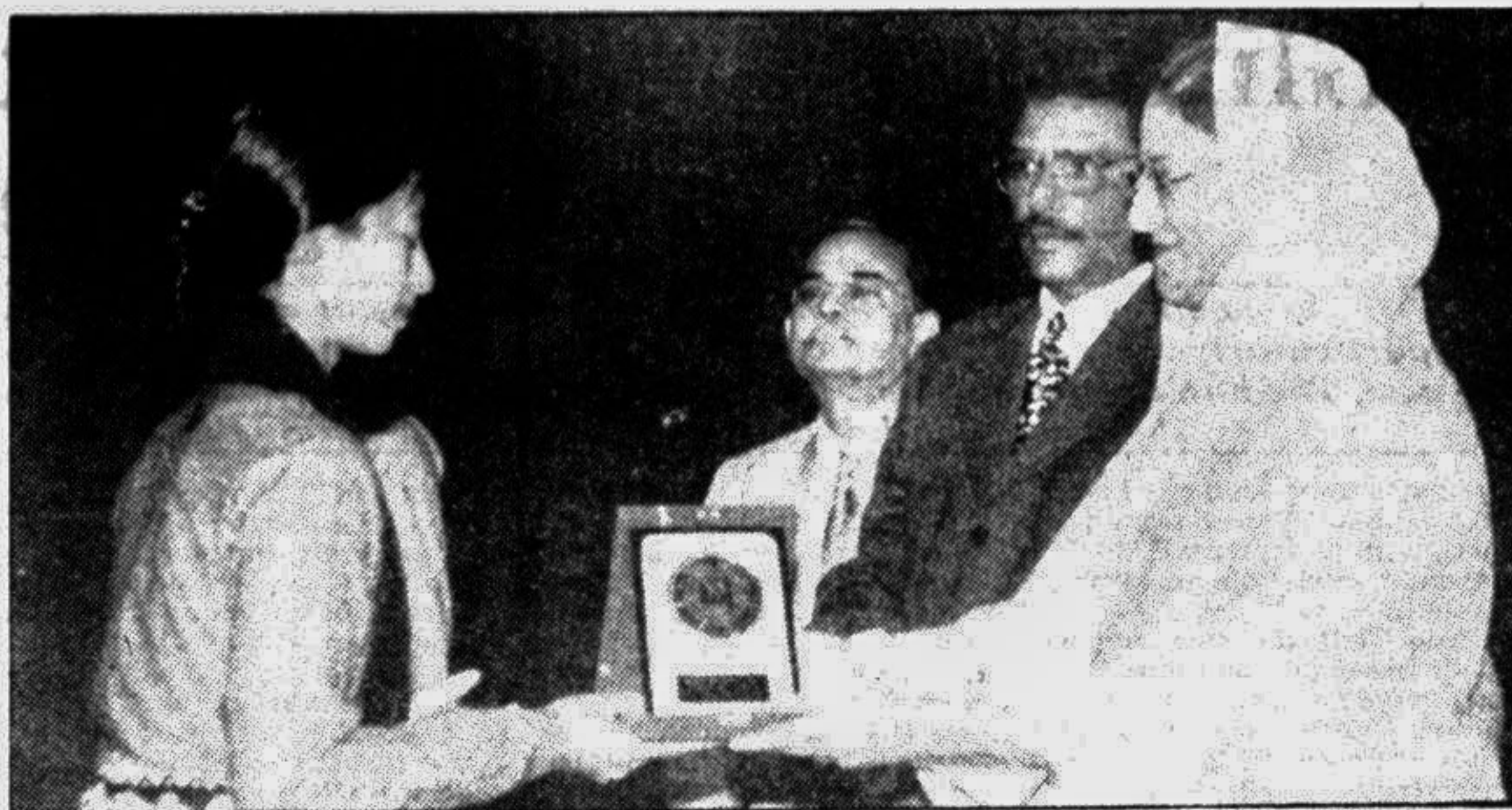
Prime Minister Sheikh Hasina inaugurated the National Youth Festival '98 at the Osmani Memorial Hall yesterday and gave away awards among youths for their contribution to youth development.