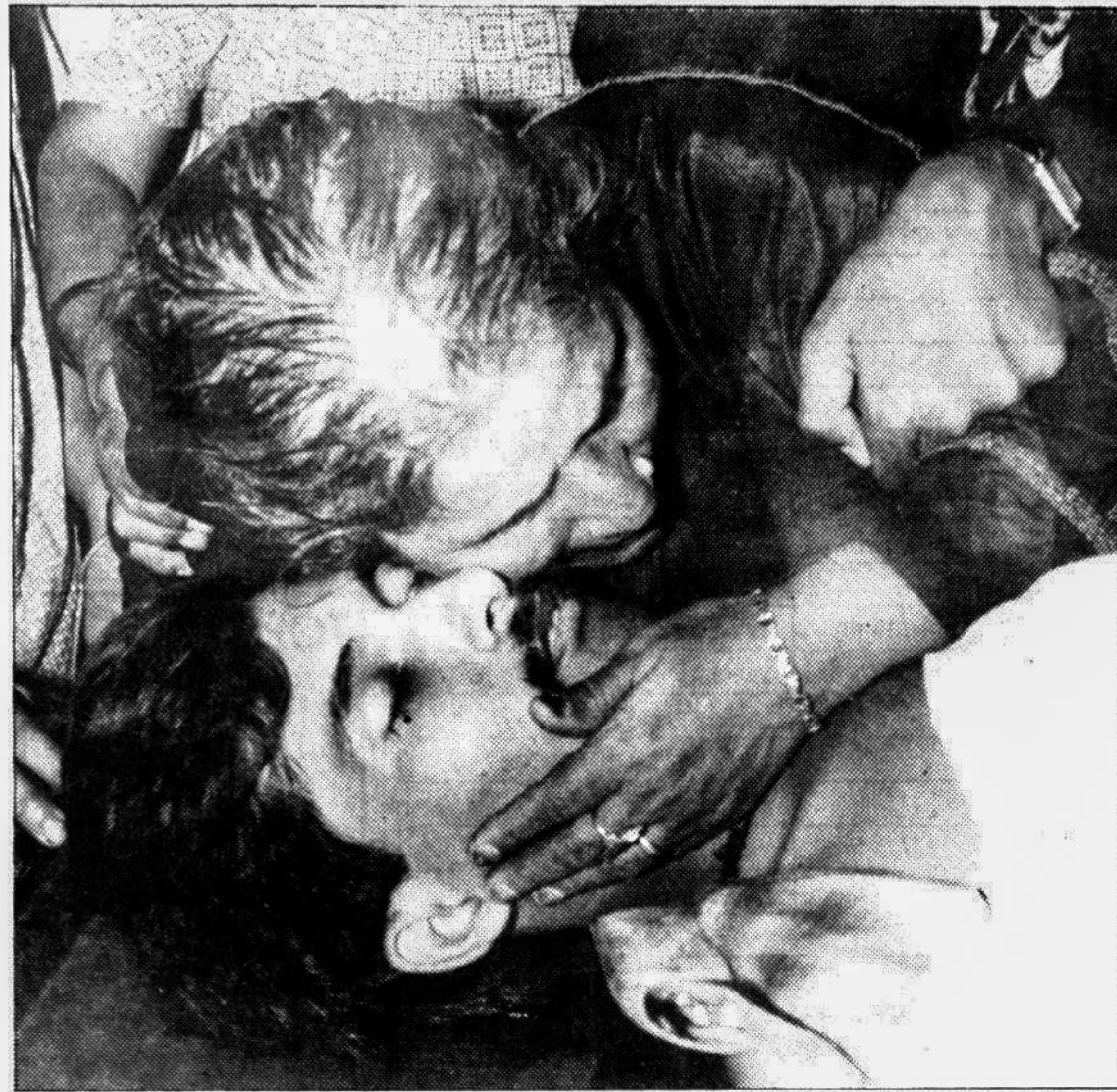
ANOTHER VICTIM: Mother wails over the body of the murdered Dhaka College student yesterday.

But the issue involving Biman, the British firm and CAAB remains to be sorted out.