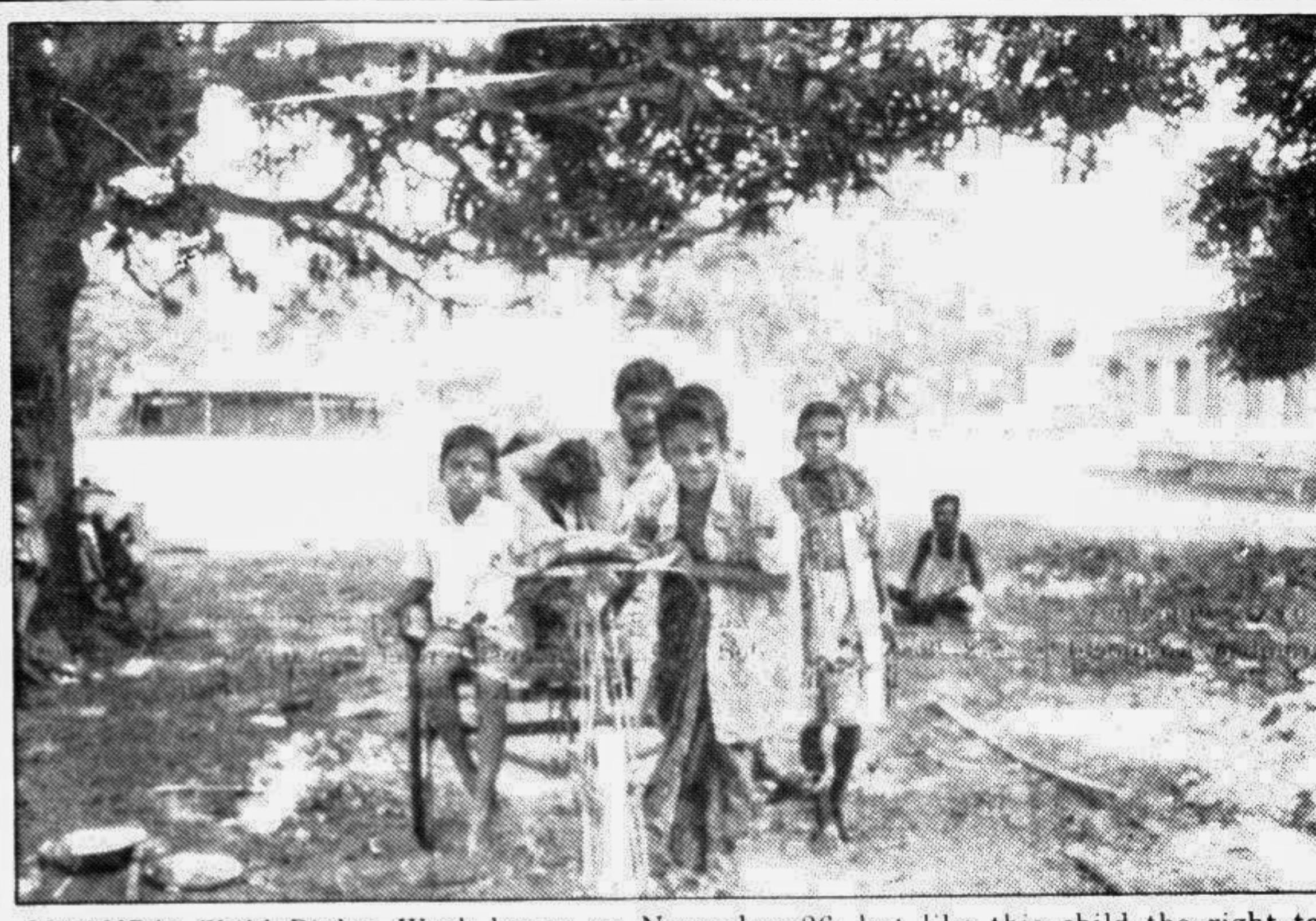
MAGURA: Child Rights Week began on November 26, but like this child the right to education, health and development of thousands of our poor children is yet to be established. The boy in the photo who is a van puller is less concerned about the significance of observing the week.

NETRAKONA, Nov 29: The holy Shab-I-Miraj was observed here on last Tuesday night with due solemnity and religious fervour, reports BSS.