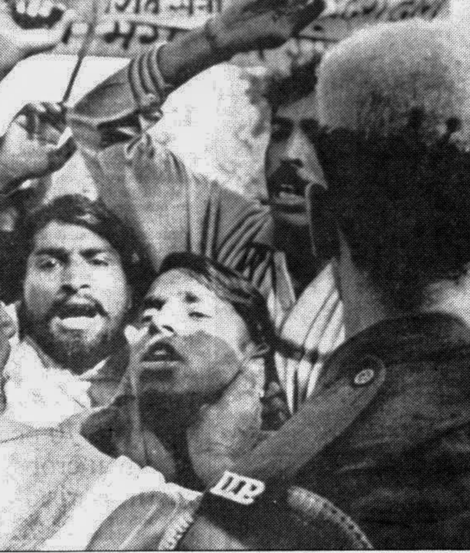
Supporters of the Indian ruling party's coalition partner Shiva Sena demonstrate near the Parliament in New Delhi yesterday against a planned tour of Pakistan cricket team.