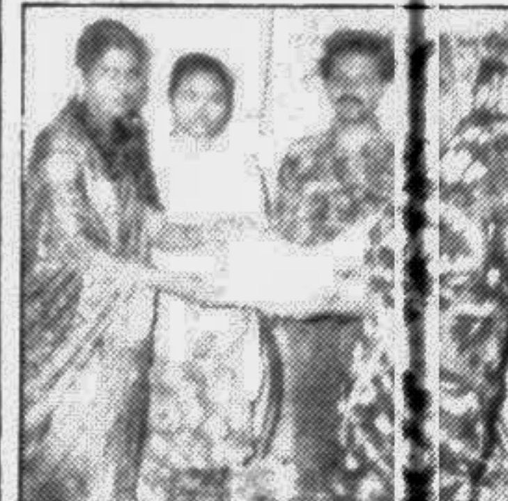
BARISAL: BRAC loan disbursement programme progressing.

BARISAL, Nov 27: BRAC, a non-governmental organisation has started disbursing money to the fish culturists, farmers and poultry farm own-