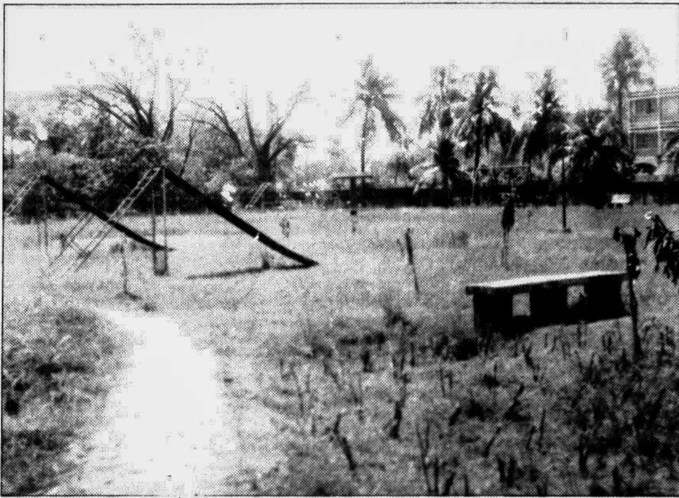
RAJSHAHI: Pitiab condition of the lone children's park here.

The extent of damage was estimated at Tk 37 crore. The zone has also incurred a loss of Tk 50 lakh as revenue during the same. Concerned source said, of the total, 135 km tracks have been damaged in broad gauge section and 43 km in the meter gauge section. The worst affected railway tracks included 30 km in Ishward-Sirajganj section, 10 km in Nature-Santahar section, five km in Amuura-Chapainawabganj section, 10 km in Rajbari-Goalunda section of broad gauge, while 10 km on Trimohini-Balashighat route of meter gauge.