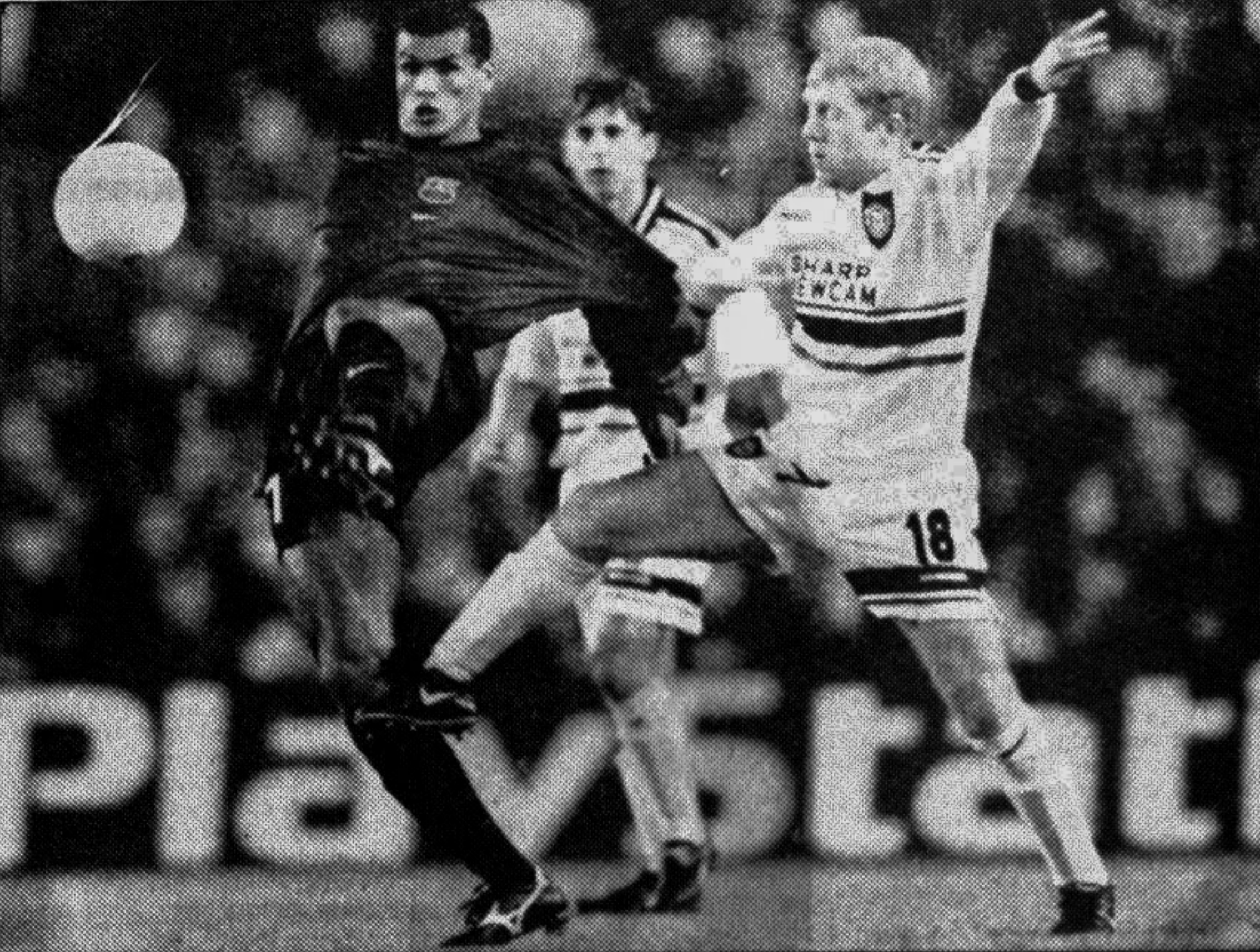
Paul Scholes (R) of Manchester United pulls the jersey of Barcelona's Brazilian superstar Rivaldo in a desperate attempt to contain the ace playmaker during their UEFA Champions' League match at Nou Camp in Barcelona on November 25.

made a superb fingertip save late on from Yorke, who has formed a lethal partnership with Cole since arriving from Aston Villa.