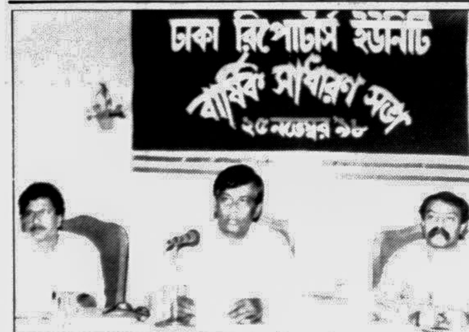
The annual general meeting of Dhaka Reporters' Unity was held at the Jatiya Press Club auditorium yesterday.