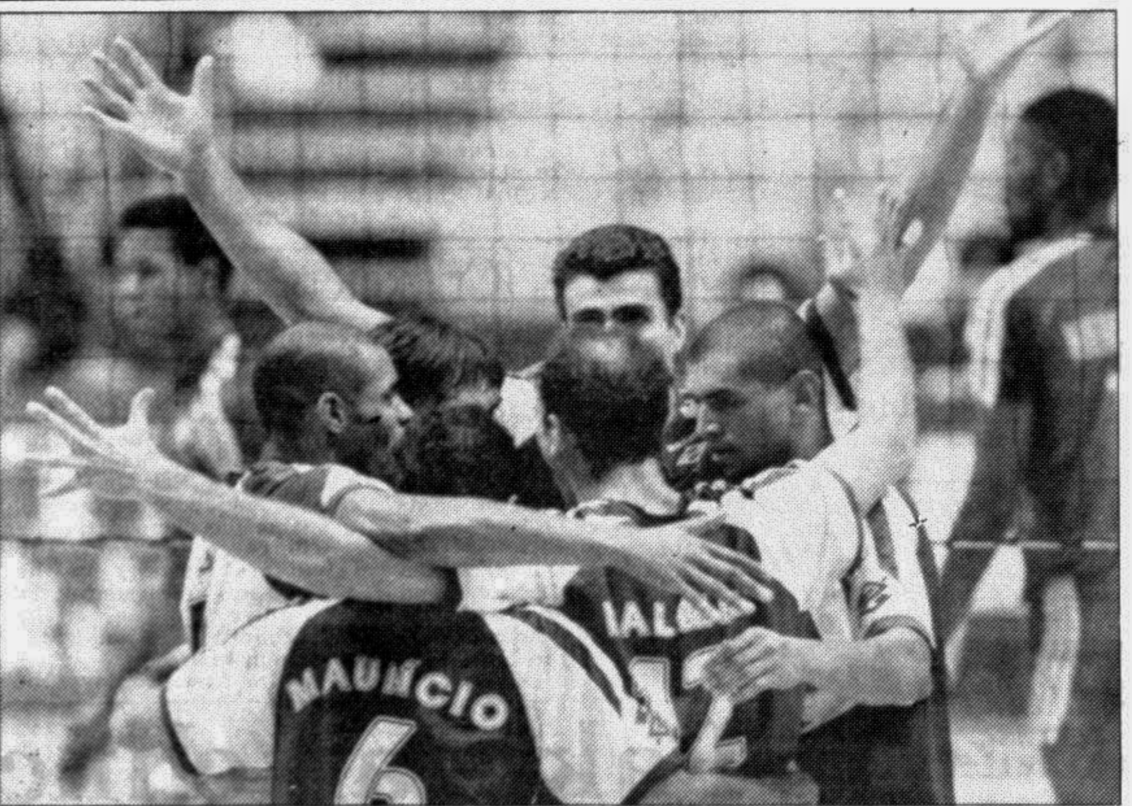
Spikers of Brazil congratulate each other after their win against Cuba in the quarterfinal round of the World Volleyball Championships at Osaka, Japan yesterday. Brazil triumphed 15-11, 15-7, 15-2.

The West Indies are scheduled to play five Tests and seven one-day internationals against South Africa in their four month tour. The only other time the two sides have ever met was in 1992 in Bridgetown when the West Indies came from behind to win by 52 runs.