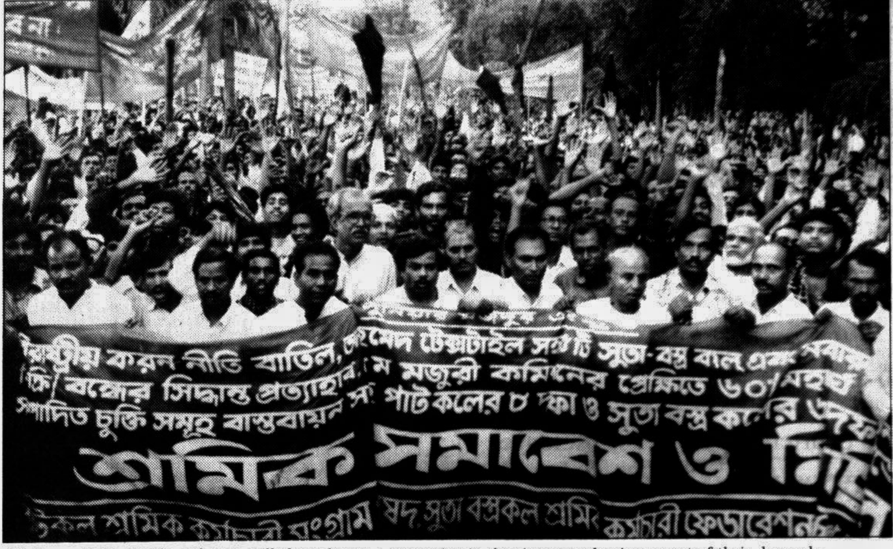
Workers of jute, textile and yarn mills brought out a procession in the city yesterday in support of their demands.

At construction sites, the magistrates issued summons to the owners. A magistrate said the owner would have to appear before the City Corporation Court at Nagar Bhaban where the magistrates would penalise them. "We have tried to impose on-the-spot fines but it did not work. Now they will appear before us and we will penalise them as per law," said a magistrate. The DCC drive will continue for an indefinite period.