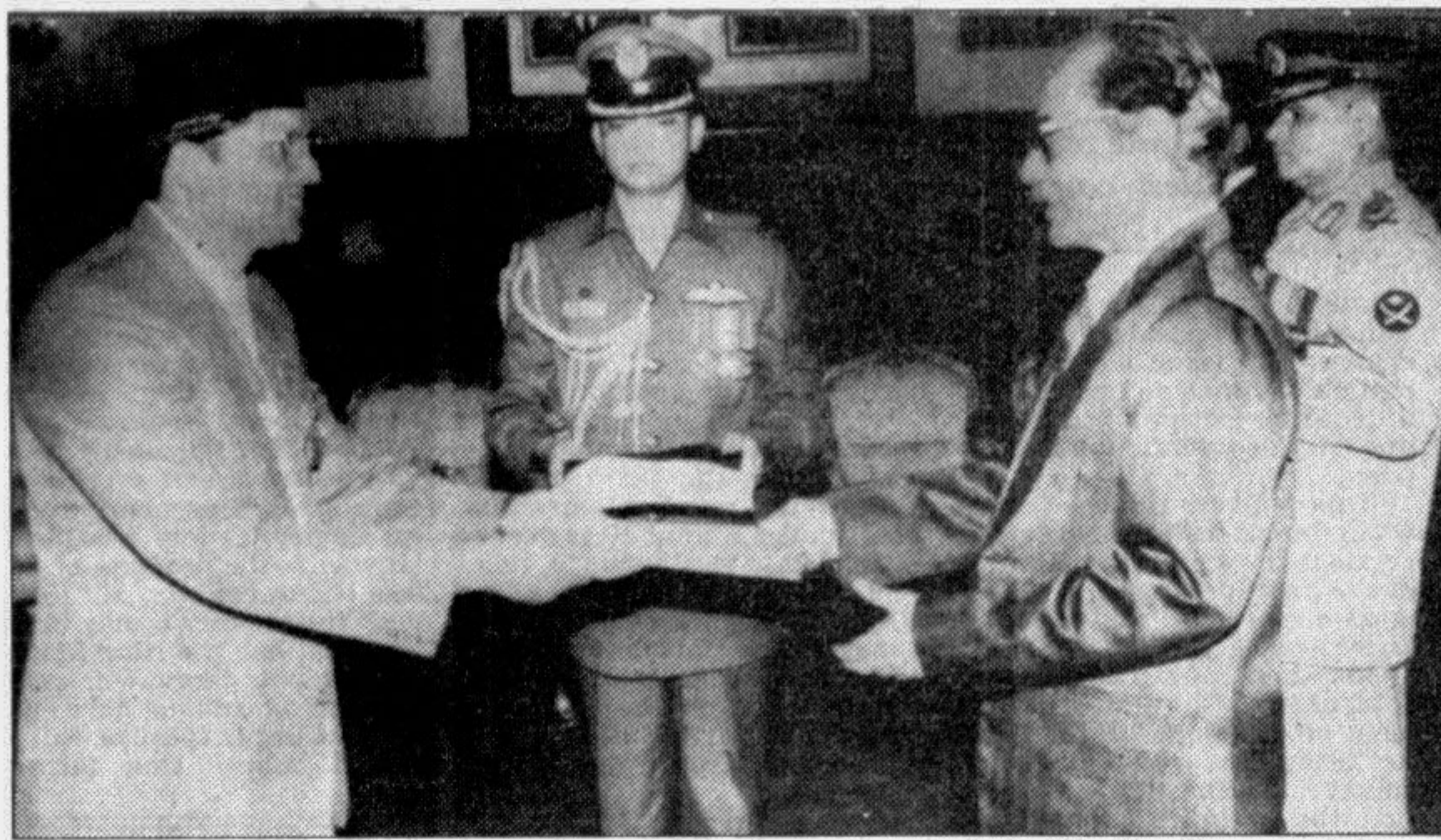
The newly appointed Ambassador of Nepal to Bangladesh Madhu Raman Acharya presenting his credentials to President Justice Shahabuddin Ahmed at Bangabhaban yesterday.

Lithi Enterprises Limited COMPUTER DIVISION House # 2, Road # 13 (old-30) Dhamondi, Dhaka Telephone: 823737, 823842, 9124001, 9124002 Fax: 880-2-9124001, E-Mail: lithi@bangla.net (Near Sobhanbagh Mosque)