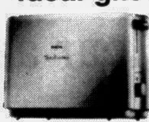
Toaster - 2 Slices