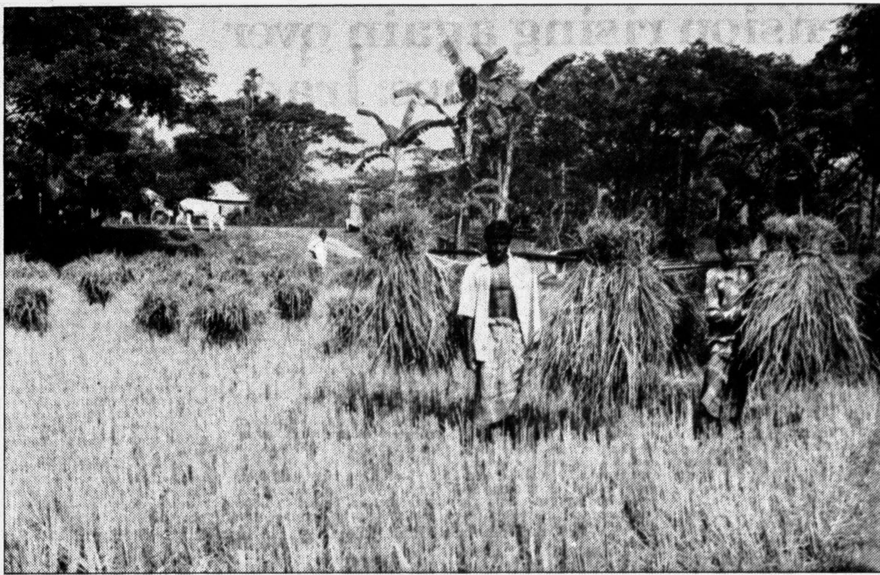
MYMENSINGH: Now is the season of Aman paddy harvesting.

NATORE, Nov 22: Life has become almost unbearable for people of the town owing to increased mosquito menace, reports APB. In absence of proper and regular cleaning of garbage and the lack of a smooth drainage system, the breeding of mosquitoes has assumed a great magnitude, the townspeople said. In particular, the Narad river flowing across the town has virtually been turned into a dumping ground as the dwellers throw their household garbage in it, they informed. The authorities of Natore pourasava, upgraded to a class-II municipality from class-III only a few years ago, is finding it an almost impossible task to effectively combat the reproduction of the insect.