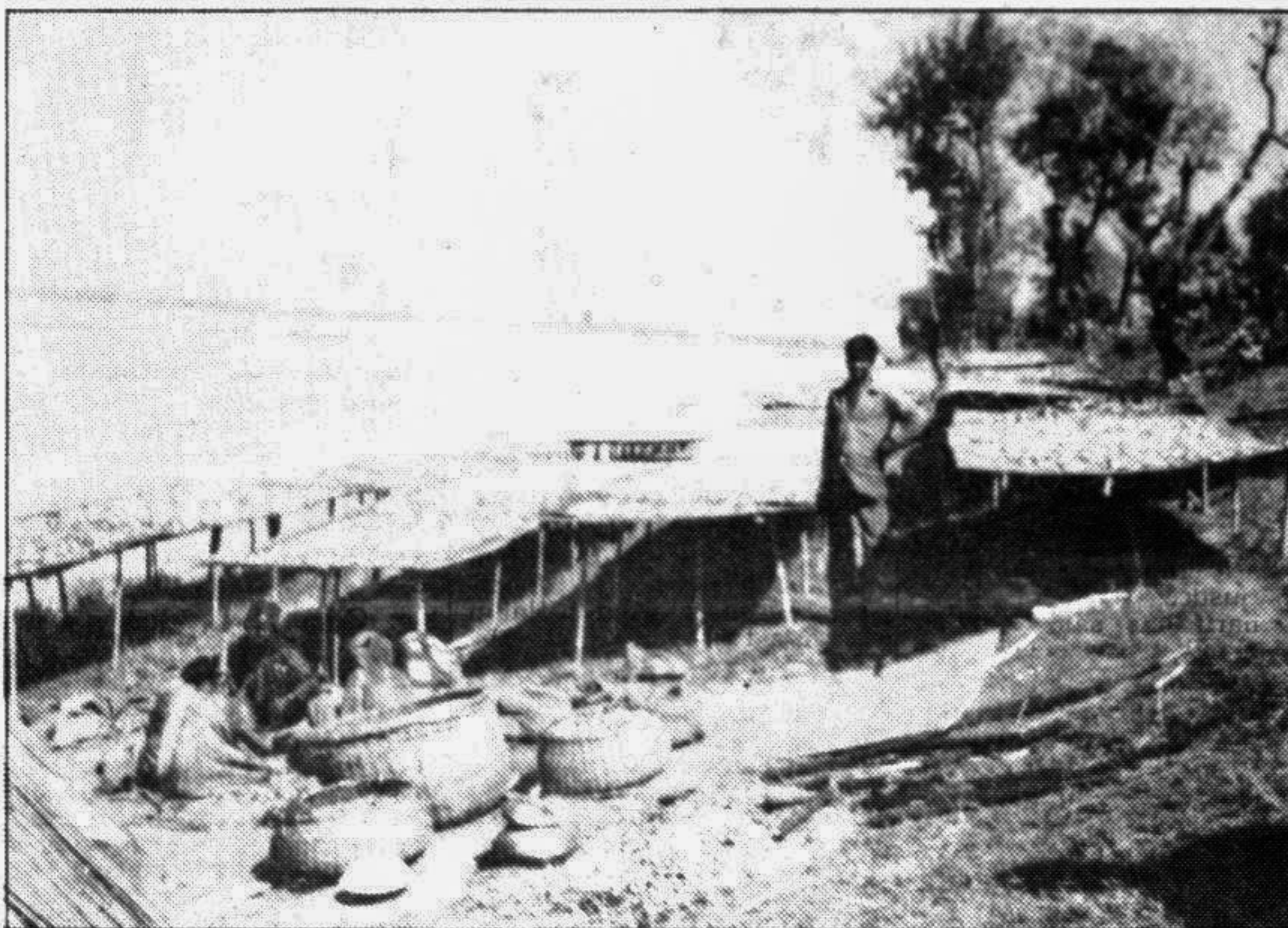
NATORE: Woman labourers working at a dry fish production centre near Chalan Beel in Shingra thana.

are doing dry fish business told this correspondent about dry fish preservation problem. They have to face the risk of loss for damage of a large quantity of fish as they have no appropriate means and ways for preserving dry fish.