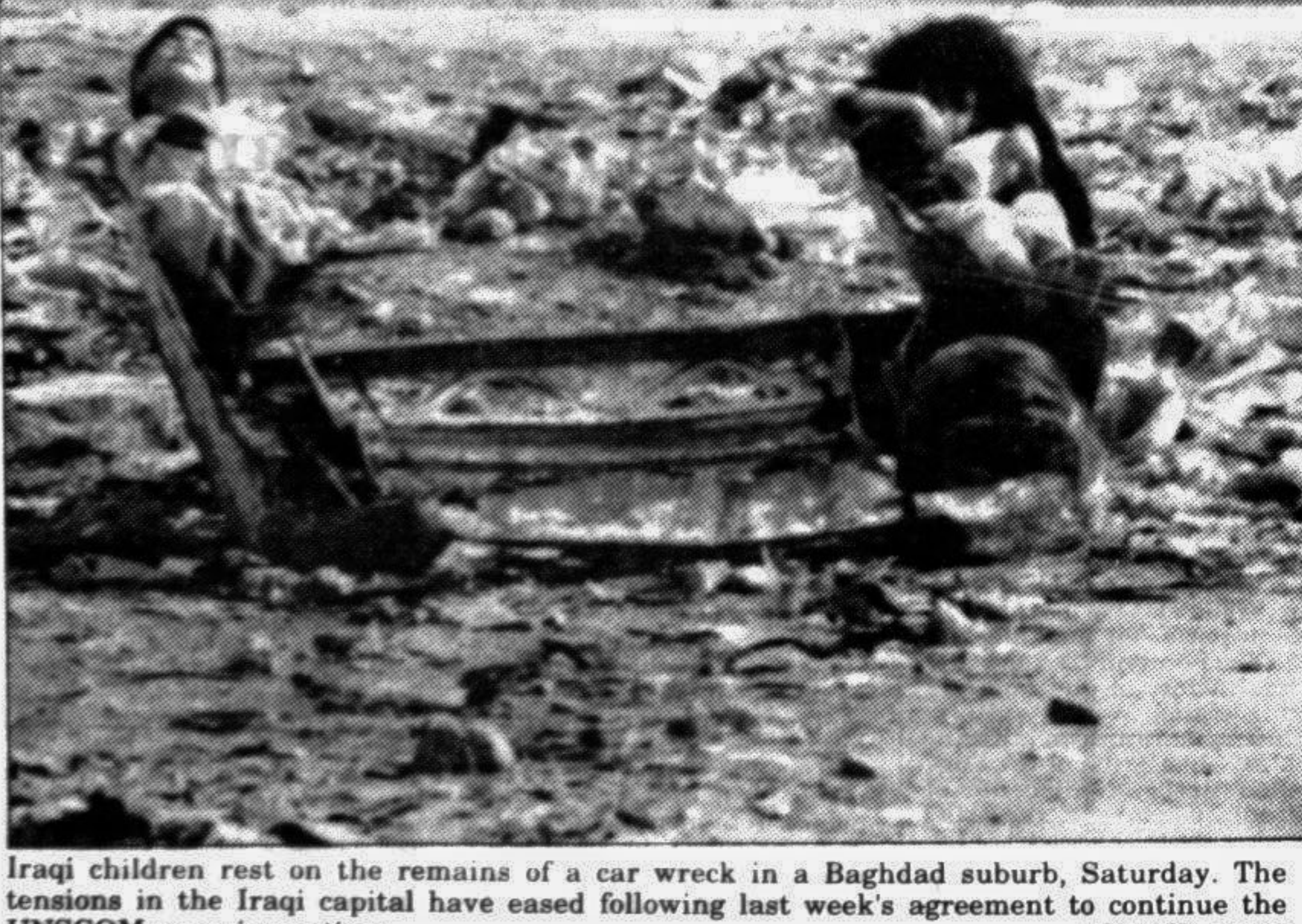
Iraqi children rest on the remains of a car wreck in a Baghdad suburb, Saturday. The tensions in the Iraqi capital have eased following last week's agreement to continue the UNSCOM arms inspections.