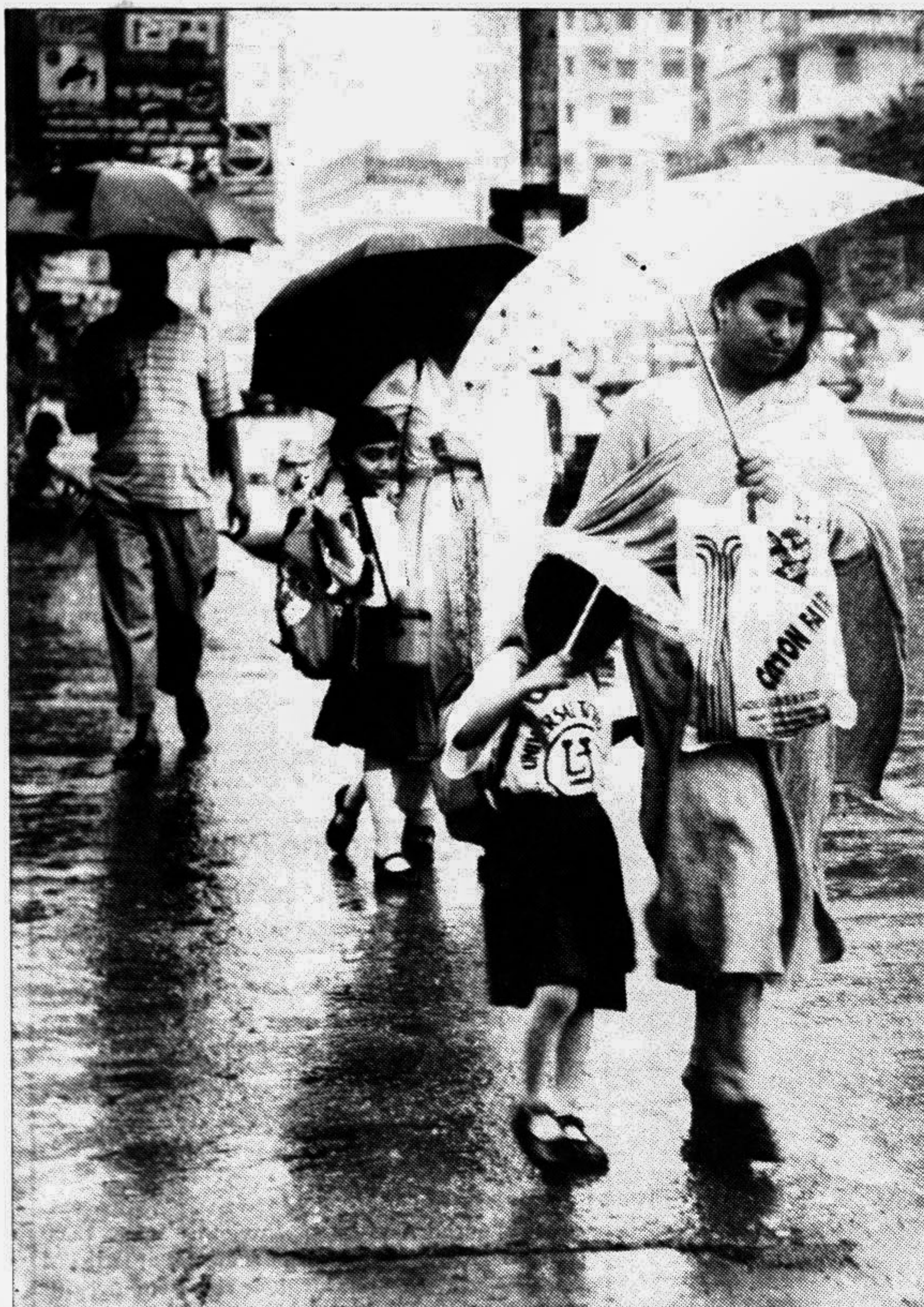
LESSER TROUBLE: It did put brakes on the normal life in the city as well as in other parts of the country yesterday but given the potent threat the hurricane posed in the coastal regions, the rain was nothing to grumble over.