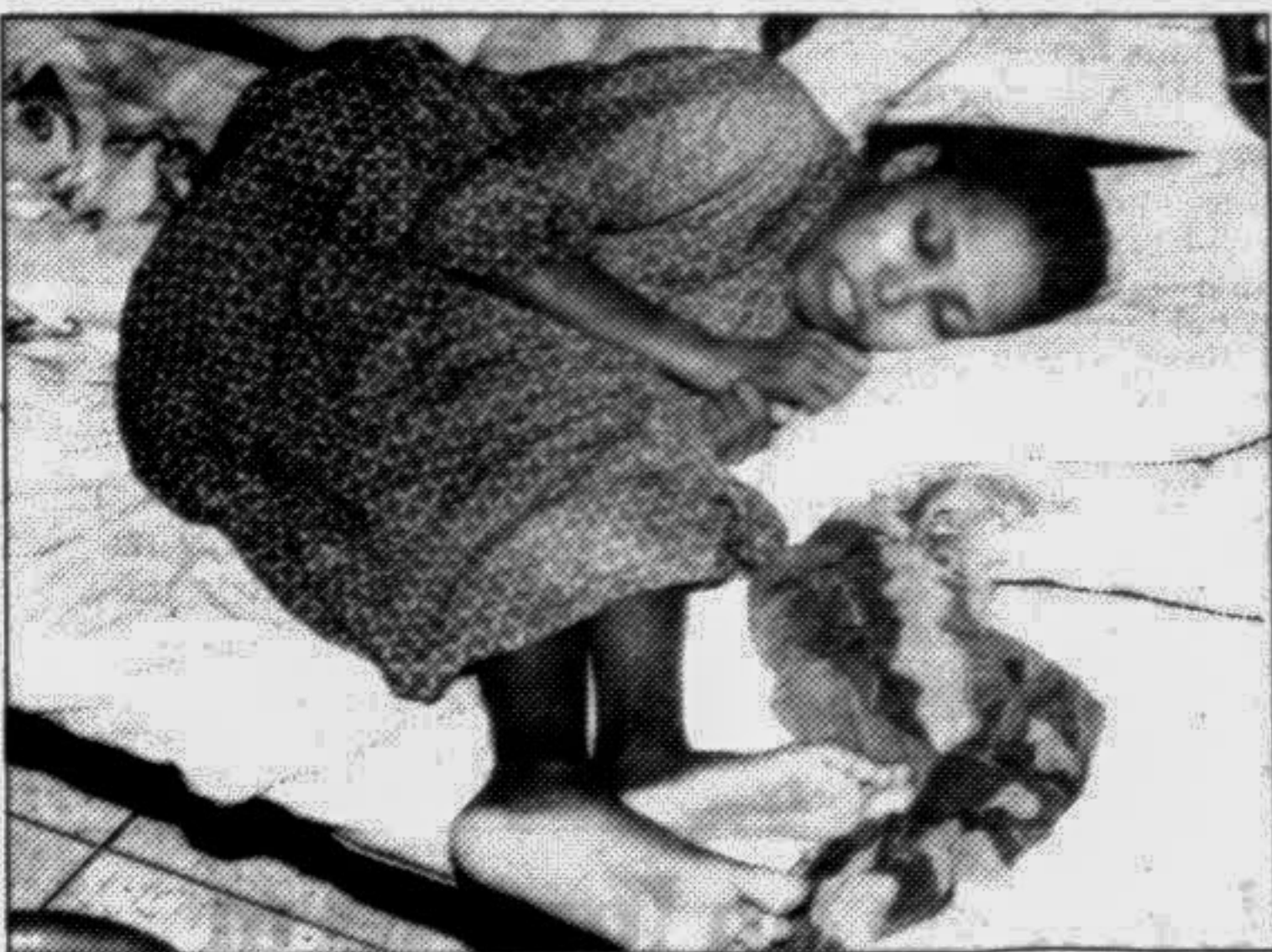
Can her mother save her?