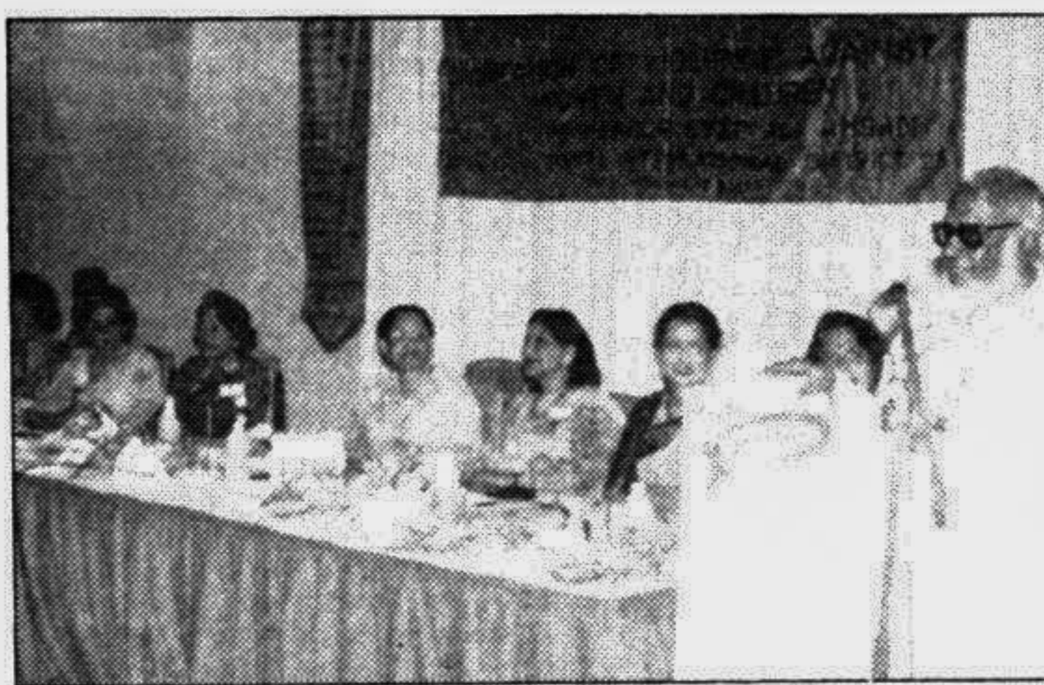
National Professor Syed Ali Ahsan addressing a seminar on 'Eradication of violence against women and children' organised by Zonta International District XXV at a local hotel yesterday.