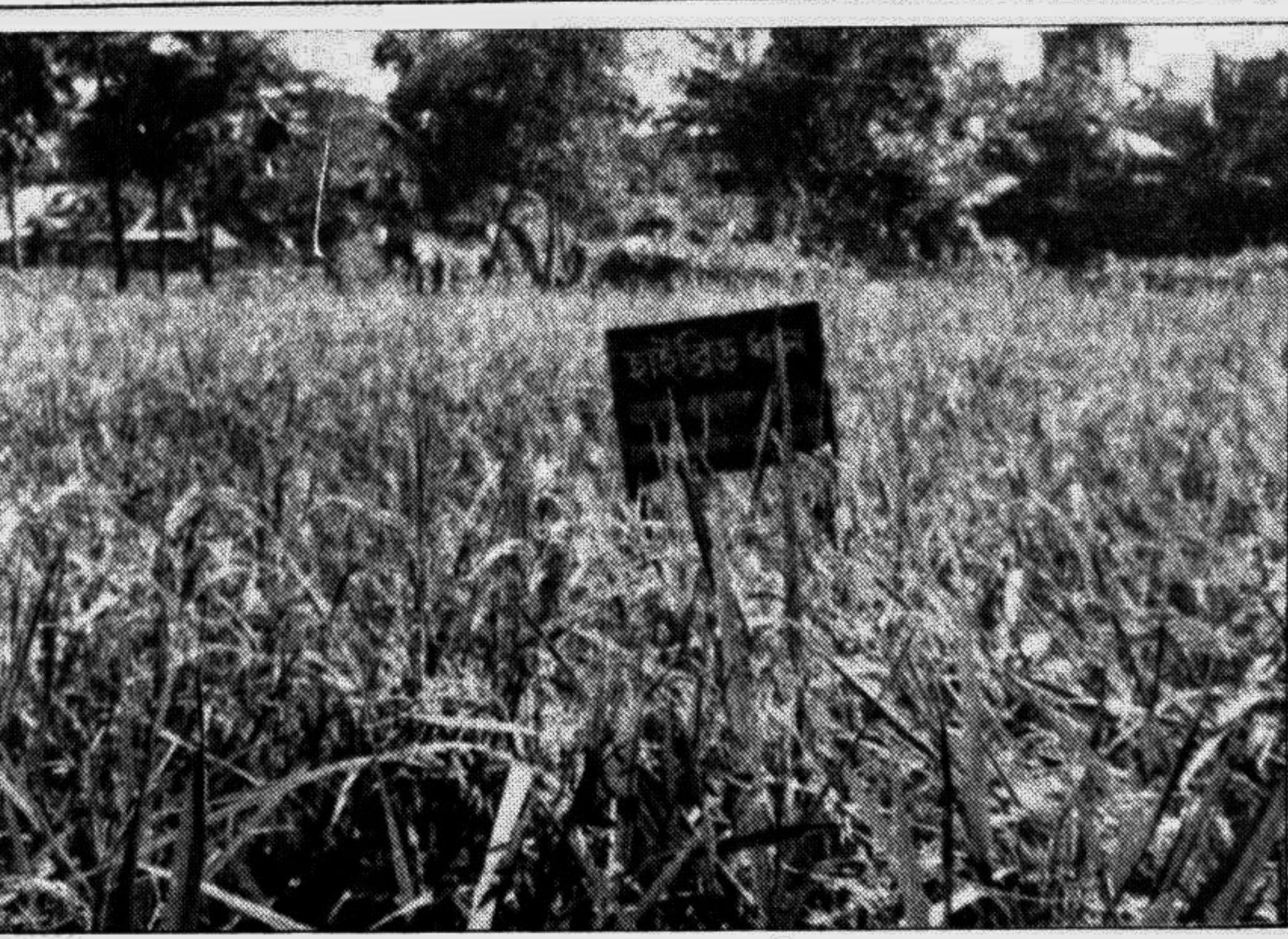
BARISAL: A flourishing high breed crop field in Barisal.