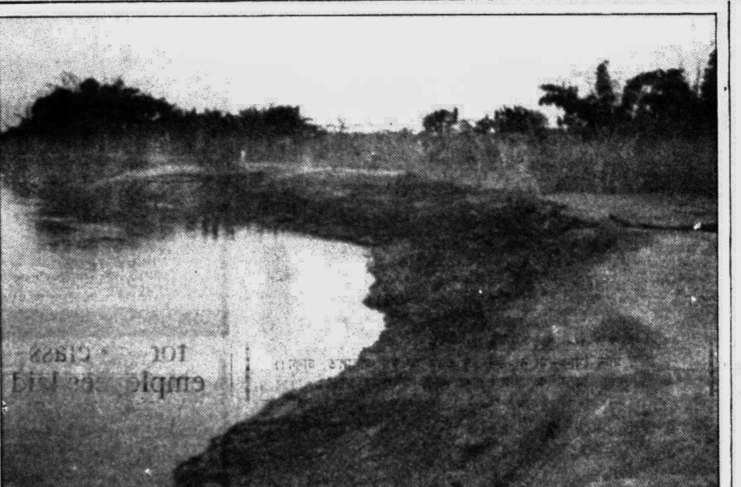
MAGURA: Unabated erosion by the river Gorai has taken a serious turn recently in Gayeshpur and Amalsar unions of Sripur thana. Photo shows the river has already devoured a vast tract of land at Char Chakdah village.