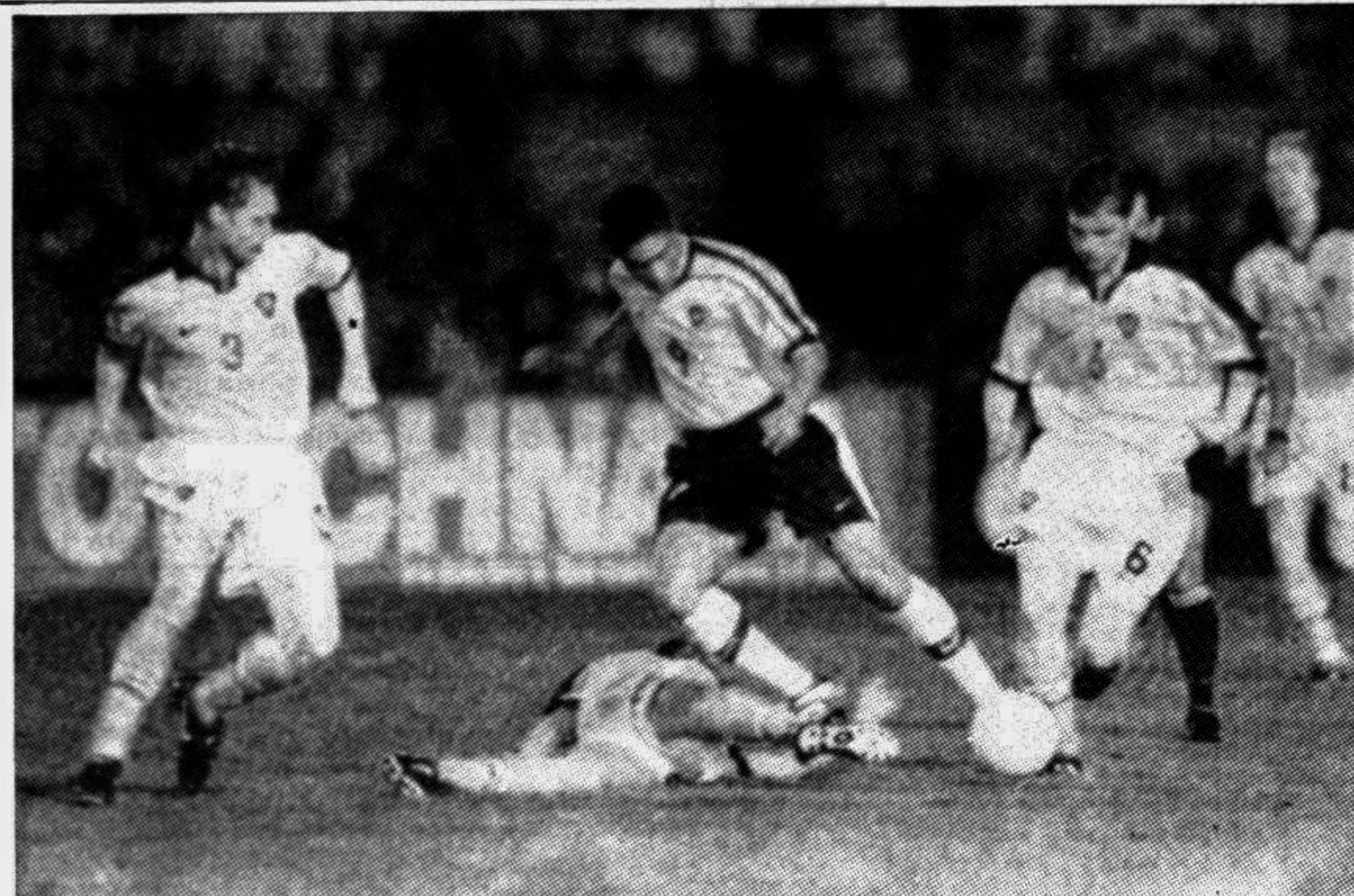
Brazil's prolific striker Giovanni Elber (C) tries to make his way through a host of Russian defenders during their friendly encounter at Fortaleza, Brazil on November 18. Brazil won 5-1.

The Spaniards were also in mourning. Their team wore black armbands in honour of