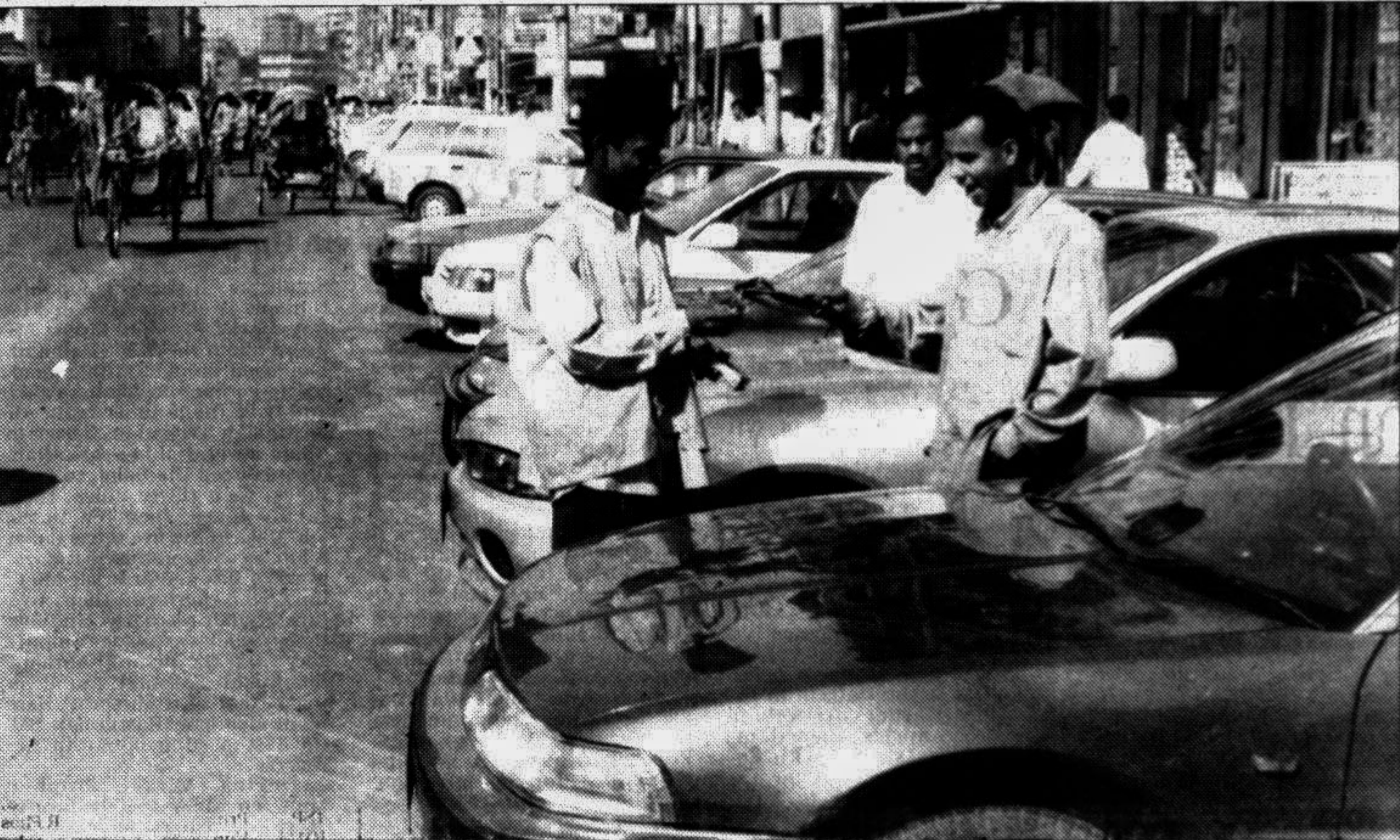
A private toll collector takes fees for parking cars at Motijheel.

"It is a pilot project and if it succeeds in Motijheel, DCC would introduce the system to some other areas of the city," he said.