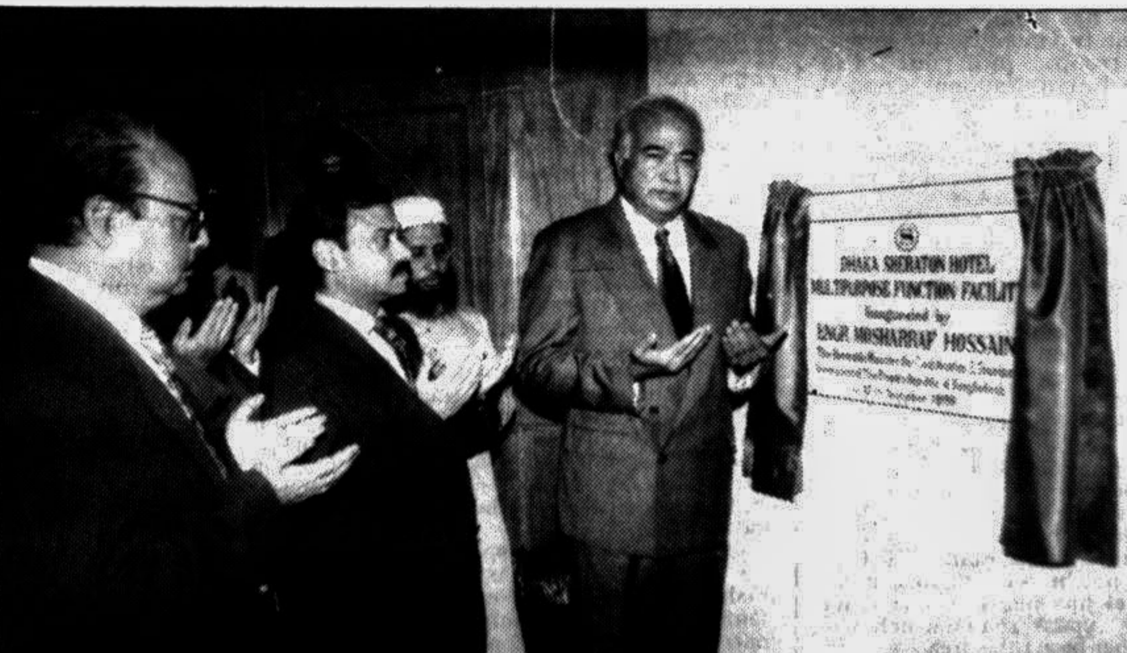
Minister for Civil Aviation and Tourism Engineer Mosharraf Hossain and State Minister for Foreign Affairs Abul Hasan offer prayer after the inauguration of a multipurpose function facility centre at Dhaka Sheraton Hotel yesterday.

He did his graduation at Dhaka University and obtained ACII from London.