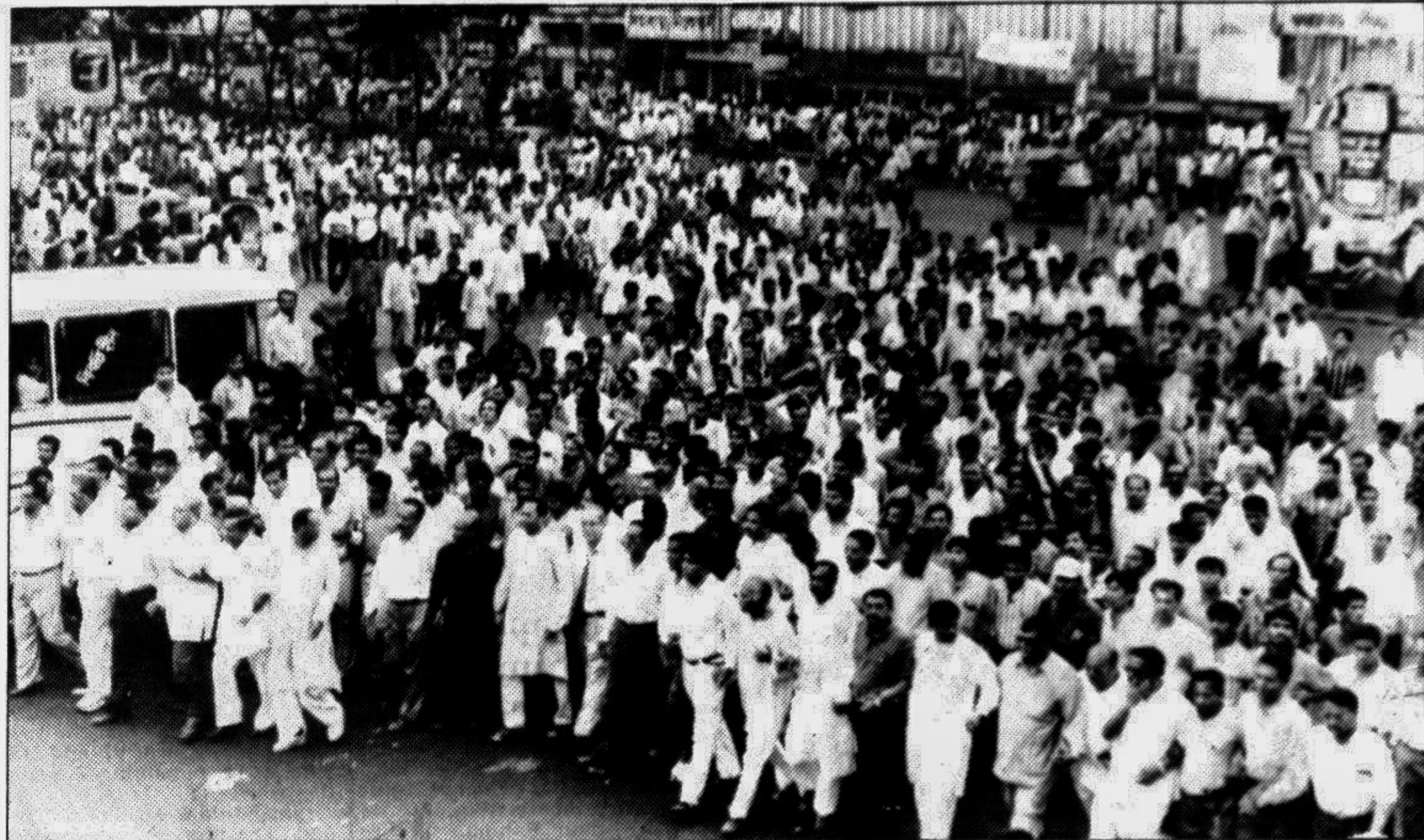
BNP leaders and activists marching towards Sangsad Bhaban in the city yesterday.

For rehabilitation of the affected poor and for income-generating works upto October, Tk 82.13 crore has been distributed. Under the rural livelihood programme, a Tk 316 crore project will be implemented, he said.