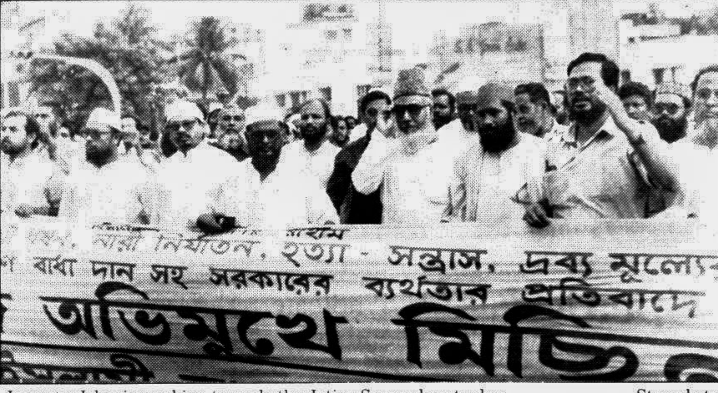
Jamaat-e-Islami marching towards the Jatiya Sangsad yesterday.