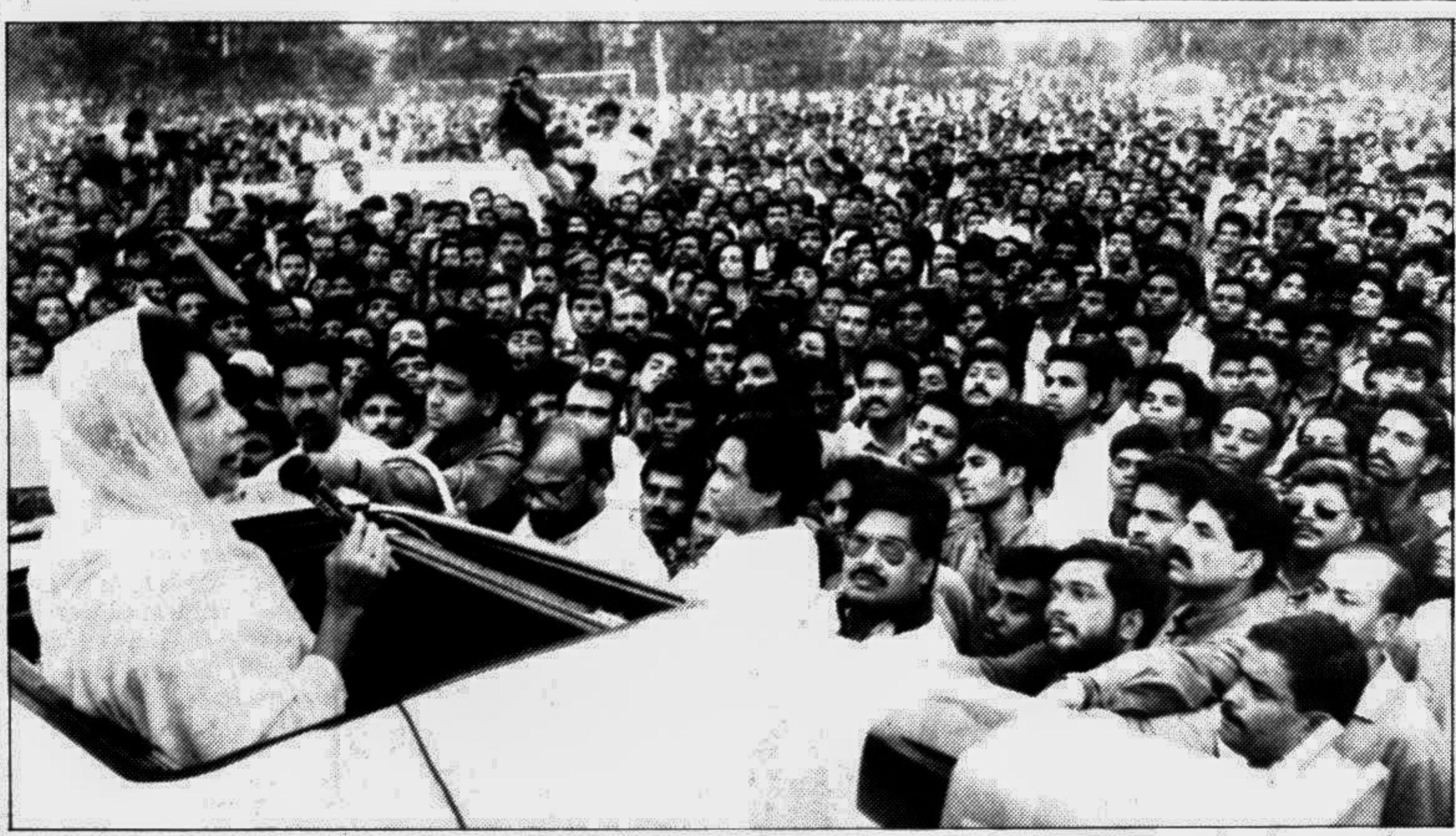
Leader of the Opposition and BNP chairperson Khaleda Zia addresses a rally at Paltan Maidan in the city yesterday prior to leading a march towards Jatiya Sangsad Bhaban.

said. Under such a situation, she said, her party could not remain silent. Accusing the government of killing her party workers one after another, the BNP chief said, "I'm not ready to hear any more wailing of mothers losing their children. I want to see smile on their faces." Referring to her party's November 7 public meeting at the Paltan Maidan, which was foiled halfway due to cracker blasts and teargas shells, Khaleda Zia said BNP had been observing the day glorifying the "people's" revolution that protected the national sovereignty. "But the ruling party backed by police attacked the meeting-bound people and foiled the rally through gunshots, blasts and teargas," she said angrily. "Police even fired teargas canisters at the podium in an attempt on my life. I narrowly