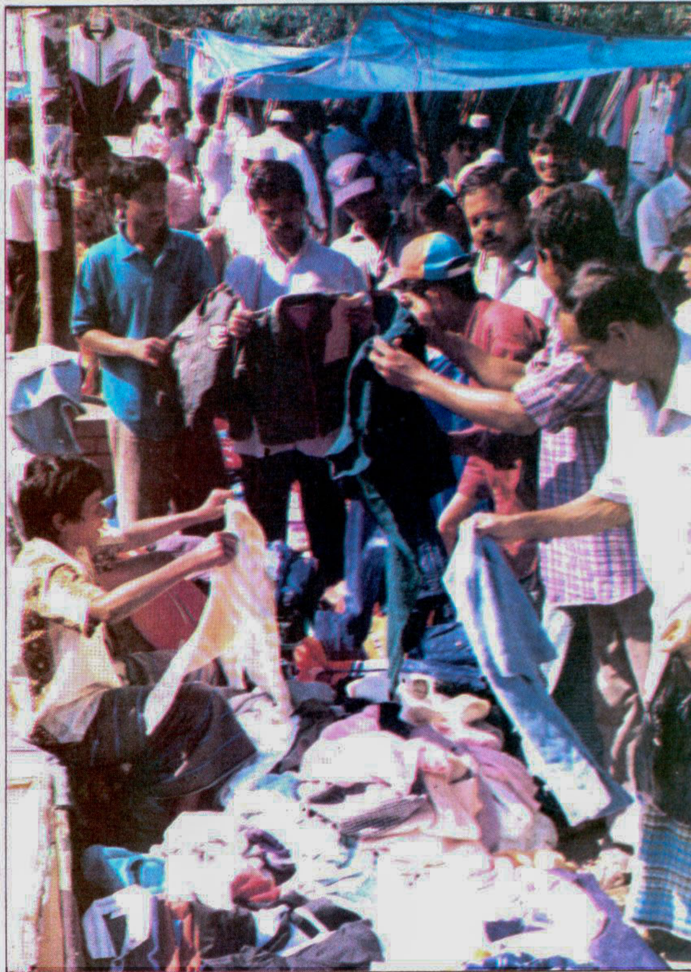
IF WINTER COMES, CAN THEY BE FAR BEHIND? There are plenty of clothes in the market, so are the buyers.

Tofail said if the present cabinet and parliament had offered the Bangabandhu to Prime Minister Sheikh Hasina, she would have spurned it.