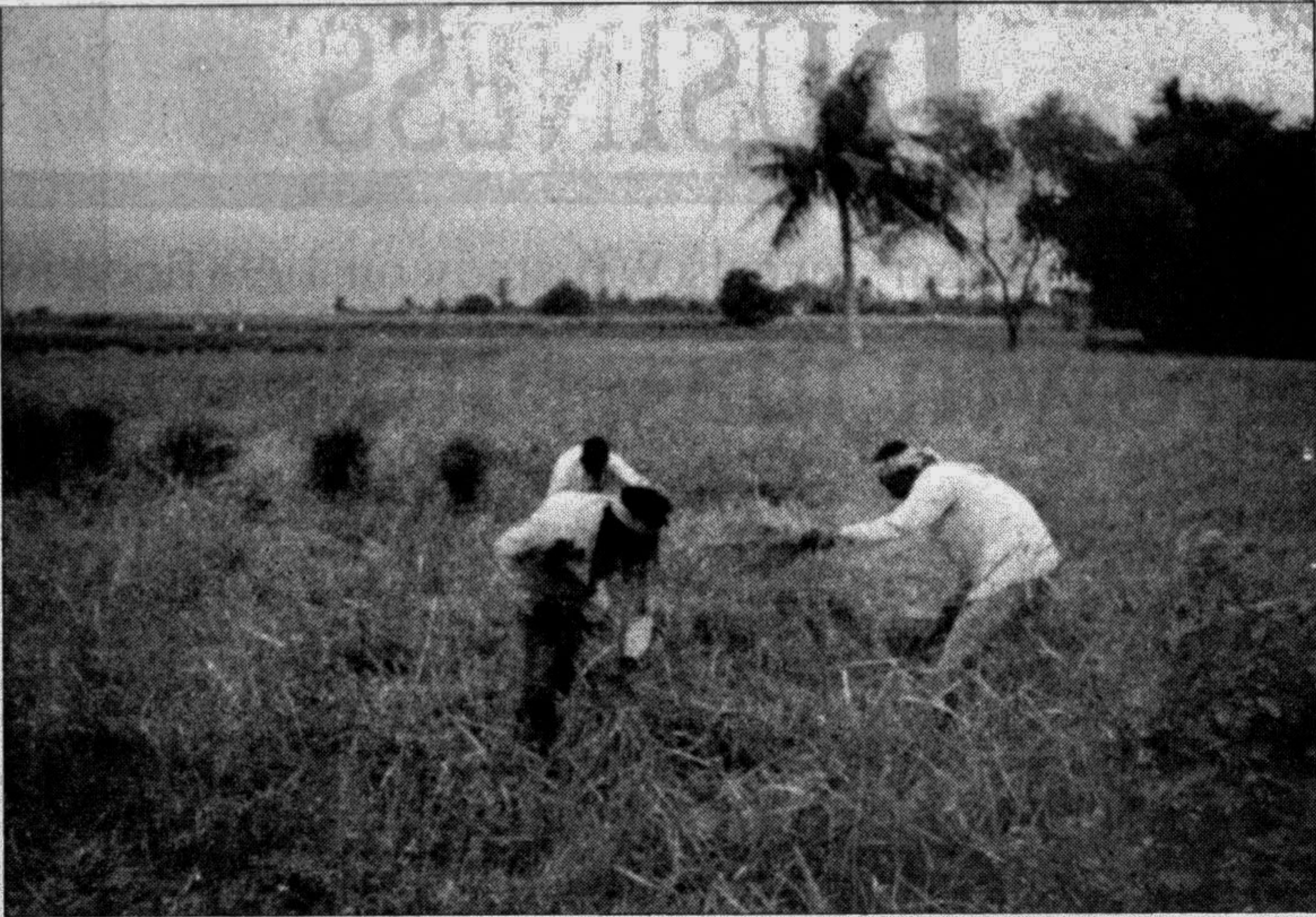
MAGURA: Harvesting of Aman paddy has started in many areas of the district.