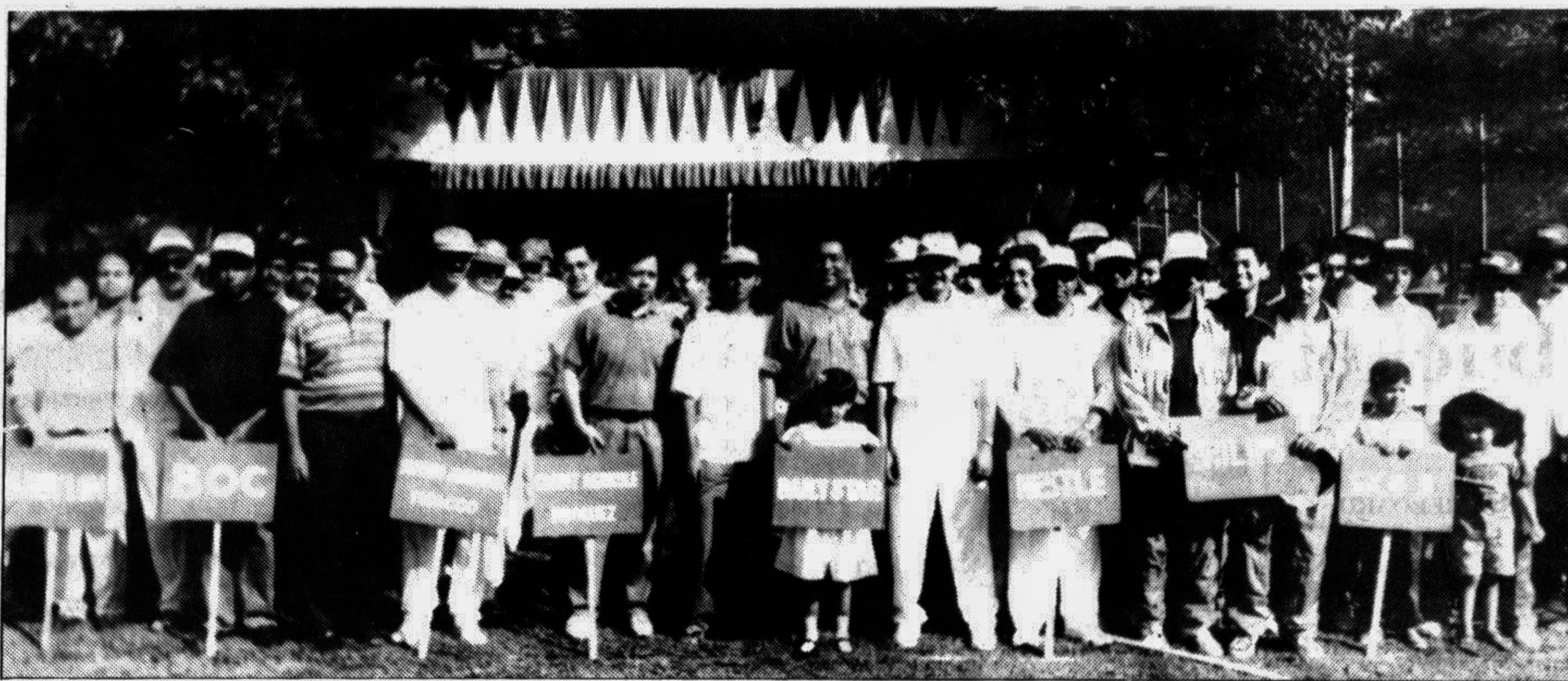
Professionals, present and future, line up during the colourful opening ceremony of the Professionals' Cup at the BAT Mahakhali ground yesterday.