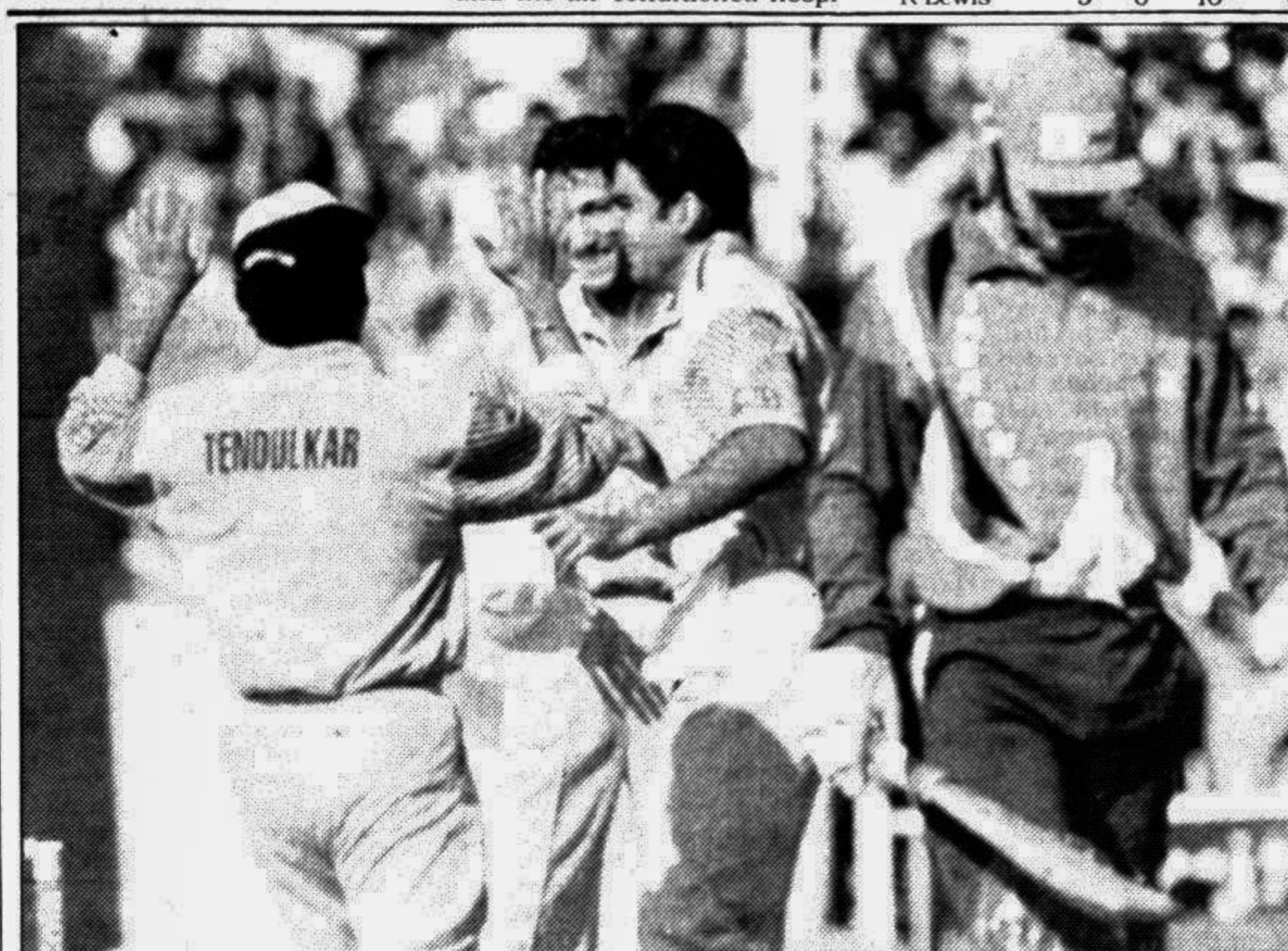
Sachin Tendulkar together with other members of the Indian team celebrate the fall of a Zimbabwean wicket in the Coca-Cola Trophy final in Sharjah yesterday.

Two of the boys were taken to a hospital, while the other was treated at the stadium's clinic.