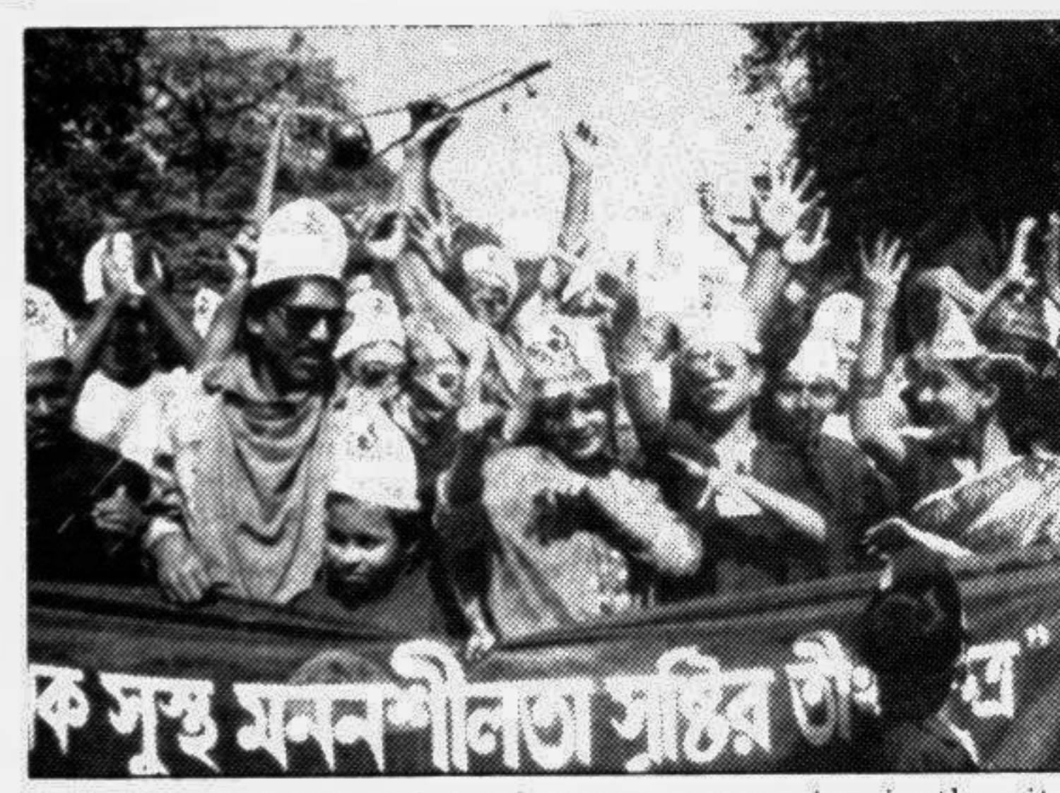
Bangladesh Theatre brought out a procession in the city yesterday to mark its 12th founding anniversary.