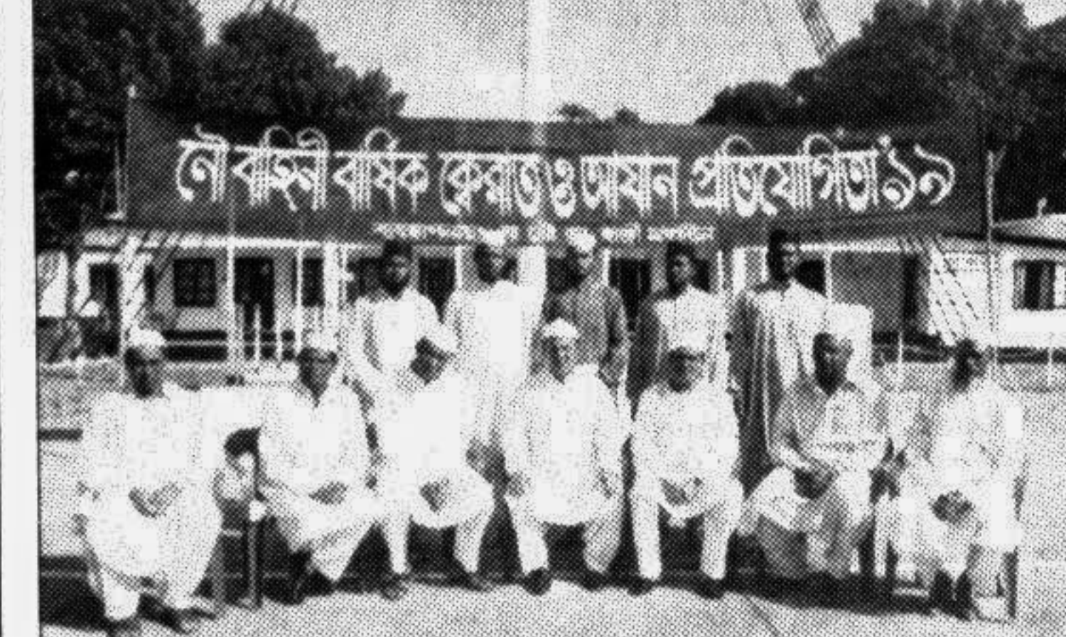
Chief of the Naval Staff Rear Admiral Mohammad Nurul Islam with the winners of the annual qirat and azan competitions of Bangladesh Navy that concluded at Dhaka Cantonment yesterday.