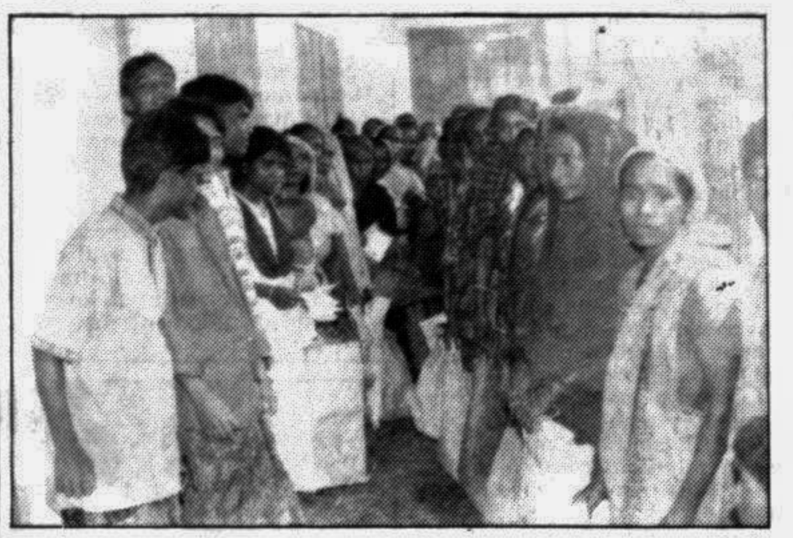
BARISAL: Rice and wheat being distributed among the VGF card holders at Asmat Ali Master Primary School in Kaunia area of the divisional town.