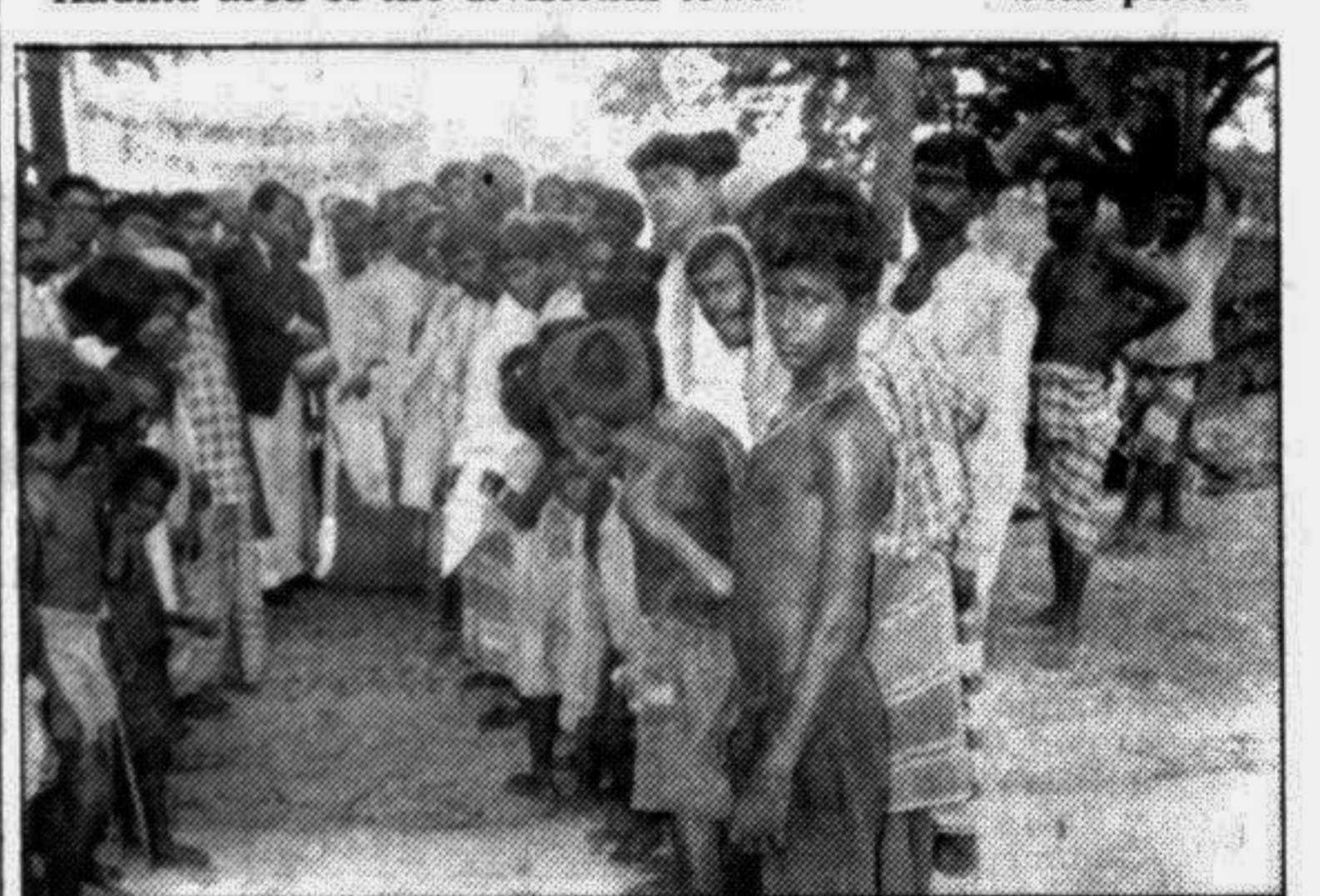
BRAHMANBARIA: A local labourers' union distributed relief materials recently among the flood affected people of the sadar thana.