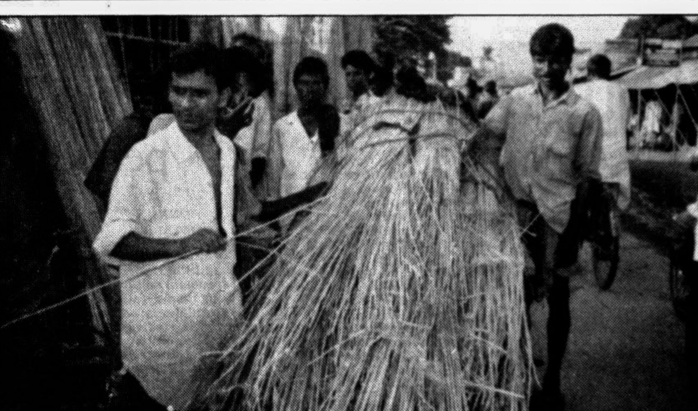
MAGURA: Jute sticks are being sold in rural areas at a higher price due to acute scarcity of fuelwood following the deluge.

Forest Department sources said that attacks by the well-armed dacoits have increased in the areas over the last six months. The pirates kidnap fishermen, Bawalis and Mowalis, hold them hostages and free them on payment of ransom. The captives are often killed in case of failure to pay the demand.