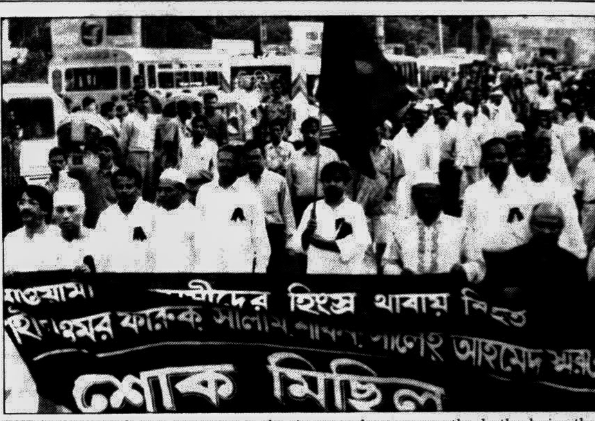
BNP leaders march in a procession in the city yesterday to mourn the deaths during the 60-hour hartal.

By DU Correspondent Elections to the Syndicate, Academic Council and Financial Committee of the Dhaka University were held at TSC yesterday. Pro-Awami League Blue Panel bagged eight seats while BNP-backed White Panel netted five. Left-leaning Pink Panel failed to get any seat.