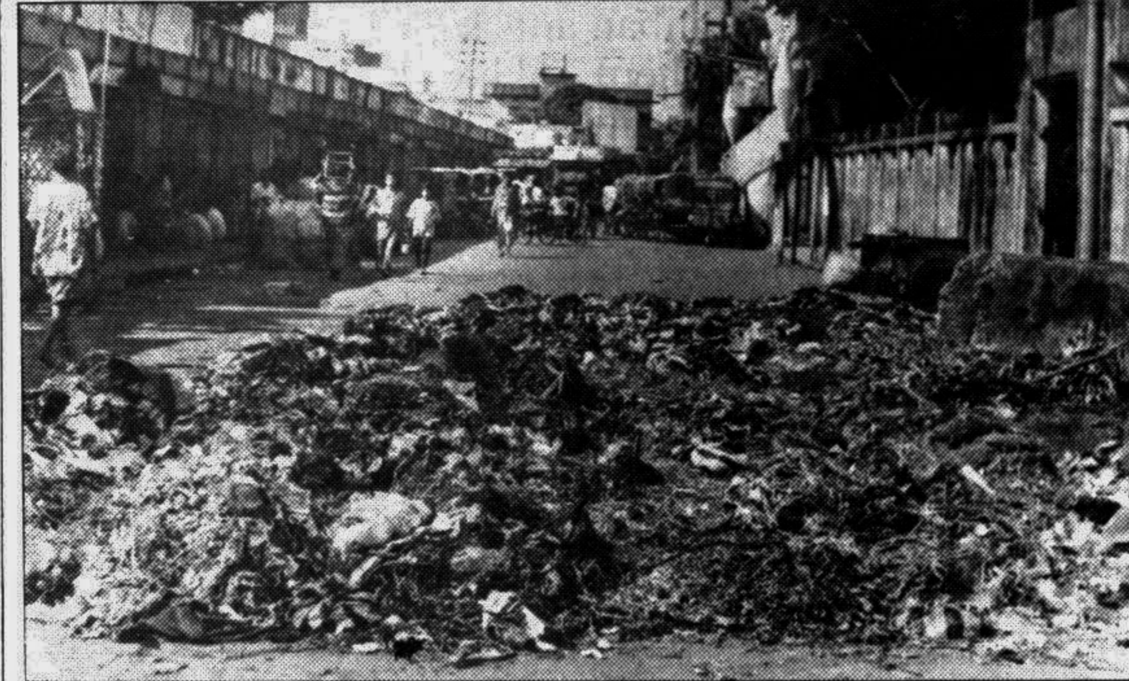
IT'S ALL GARBAGE: The opposition hartal, which hampered City Corporation's regular scavenging activities, as the picture taken from Dhupkhola yesterday shows, left many areas in the city littered with garbage spreading foul odour and disturbing normal life.