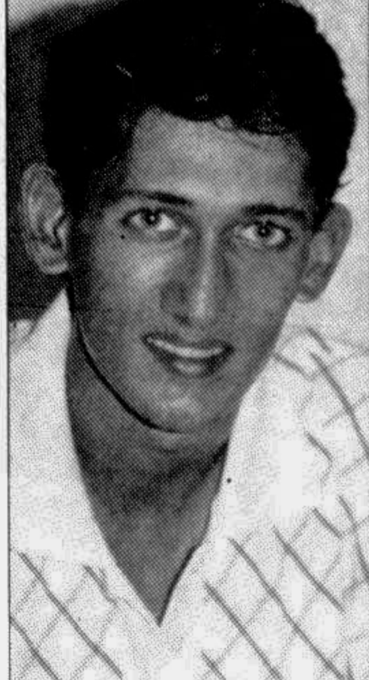
AJIT AGARKAR... p-o-m

"We did exceptionally well in the field in the first session but