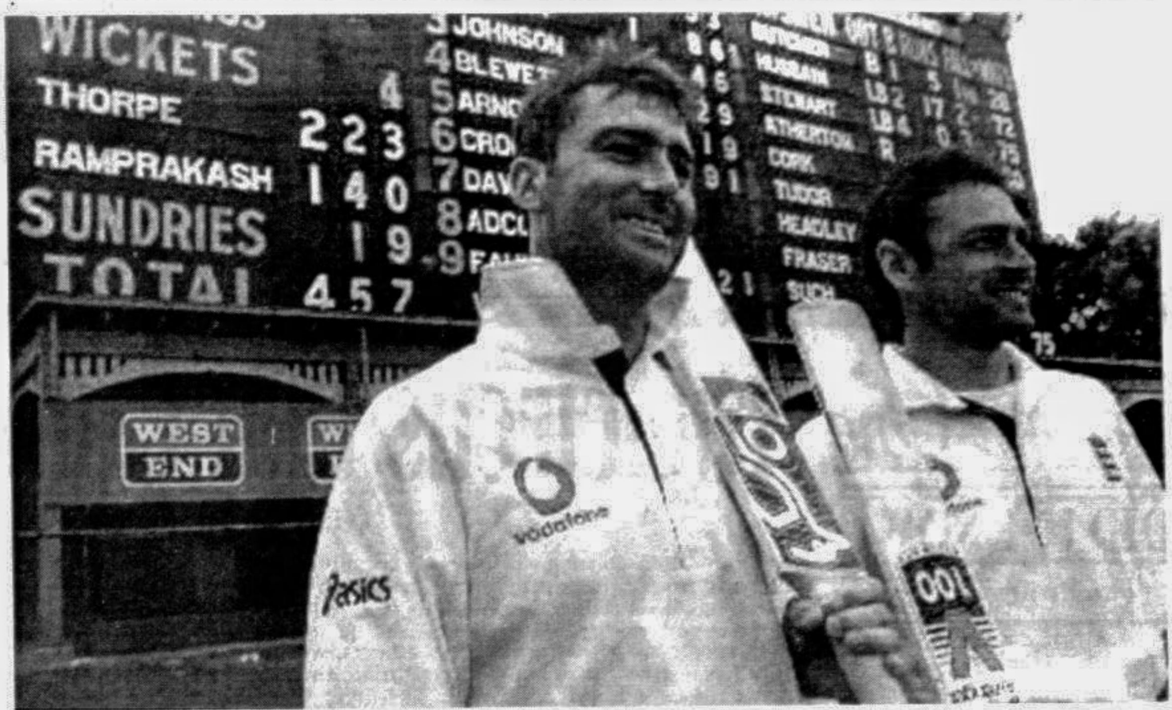
England batsmen Graham Thorpe (L) and Mark Ramprakash standing in front of the scoreboard after their match-saving effort against South Australia at the Adelaide Oval yesterday.