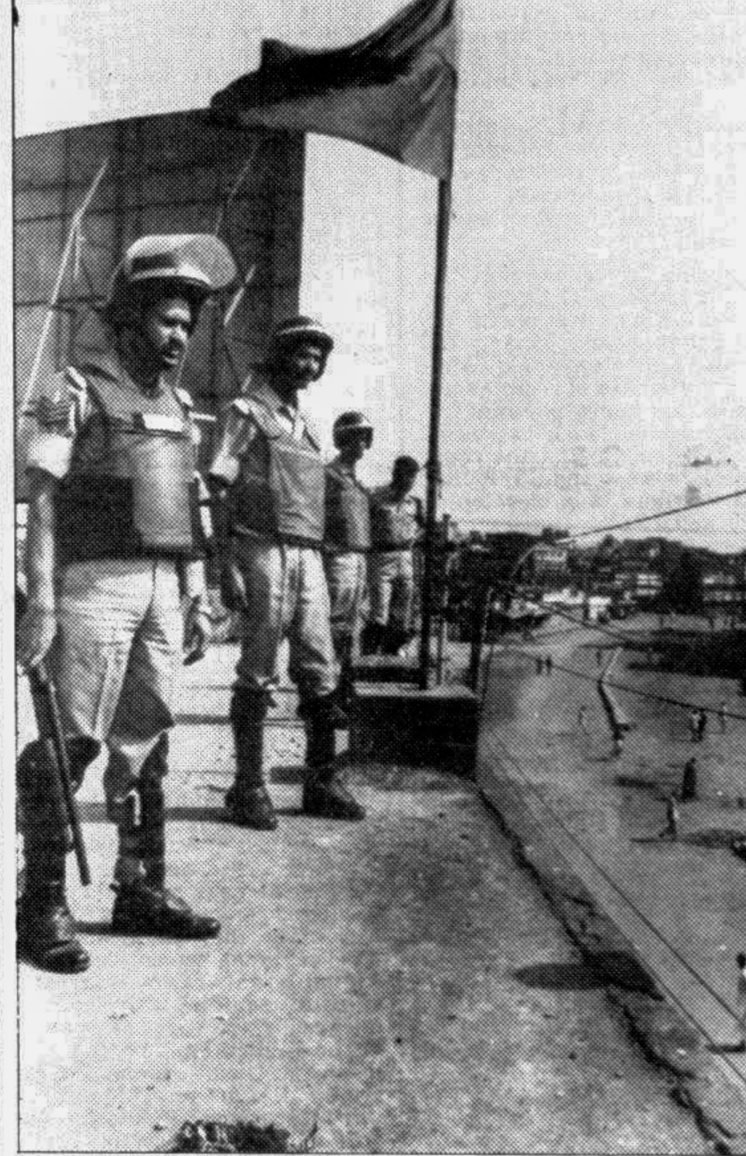
TROUBLE SPOT: Police stand on the roof of city BNP office at Nawab Yusuf Market, an area where heat of the hartal is usually felt most everyday.