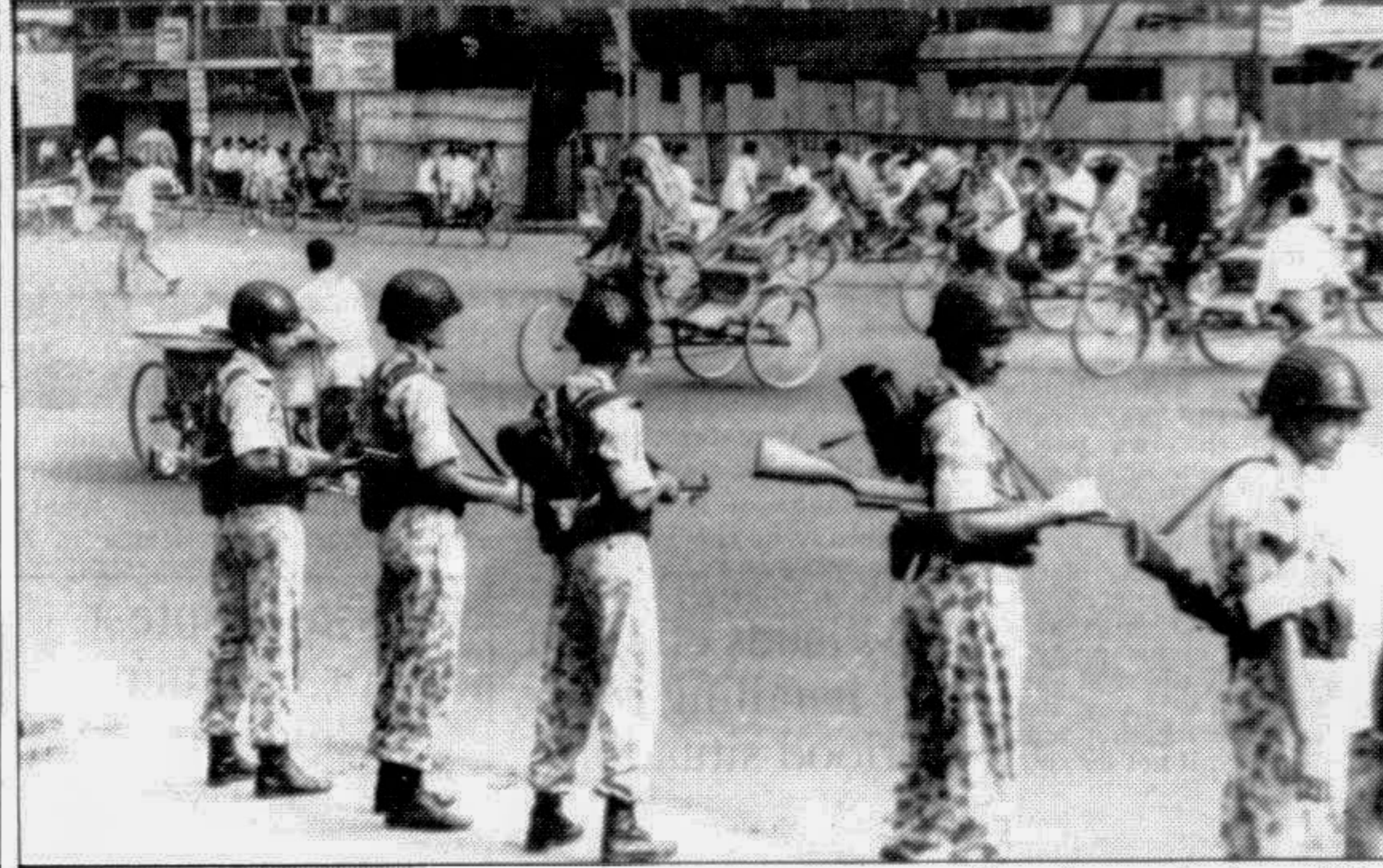
Paramilitary troops stand vigil at Paltan crossing in the city yesterday while rickshawpullers find their life better on a street extremely busy on a normal day.

On the contrary, Nasim said, prime minister Sheikh Hasina has sacrificed her paternal house at Dhanmondi for public cause and is also planning to donate her house at Tungipara.