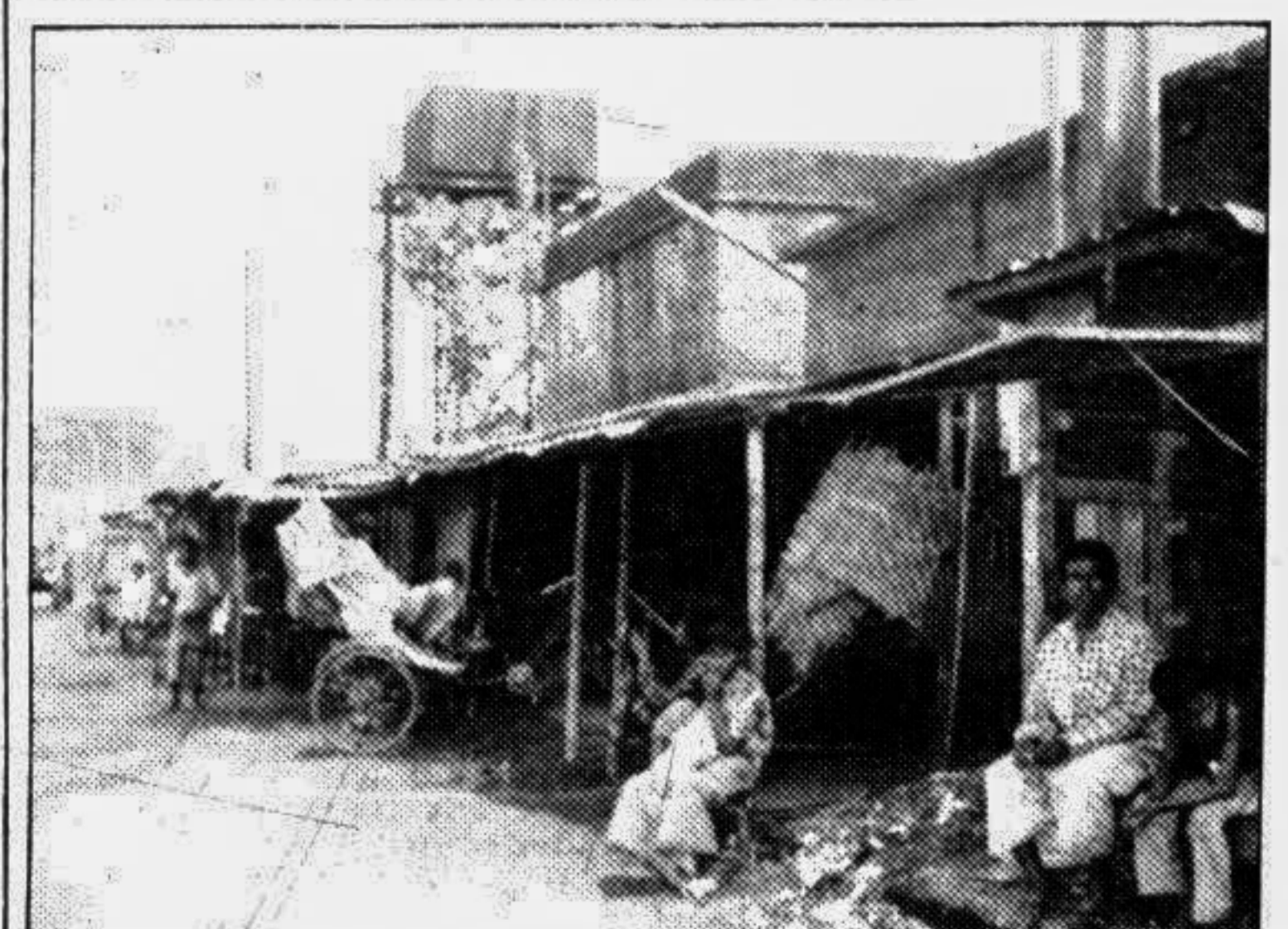
SYLHET: Some people have occupied the valuable lands adjacent to Sylhet Railway Station. They have erected unauthorised shops on the lands. Anti-social activities are going on at night in these shops, but no action is being taken by the members of law enforcing agencies.

From Our Correspondent BOGRA, Nov 10: A total of Taka Two lakh has been allocated from the Prime Minister's Relief Fund for repairing damaged houses in Bogra district during the last deluge. District Relief and Rehabilitation Office demanded Taka 50 lakh in cash and CI sheets of 20 thousand bundles for repairing more than 62 thousand flood damaged houses. The government allocation is too meagre to meet the huge building cost in 11 thanas. According to the report of the district relief office, about 62 thousand 2 hundred houses were damaged partially or completely in the district. The partially damaged houses are 53 thousand 4 hundred 64 and completely damaged houses are 8 thousand 7 hundred 54. The affected people of Dupchachia will get the highest amount at the rate of Taka 34 and paisa 30. Government sources said, 5 hundred 30 houses were damaged due to flood and heavy rain in Dupchachia thana. An amount of 46 paisa will get each and every people of Shariakandi thana as 39 thousand 1 hundred 35 houses were damaged in the thana.