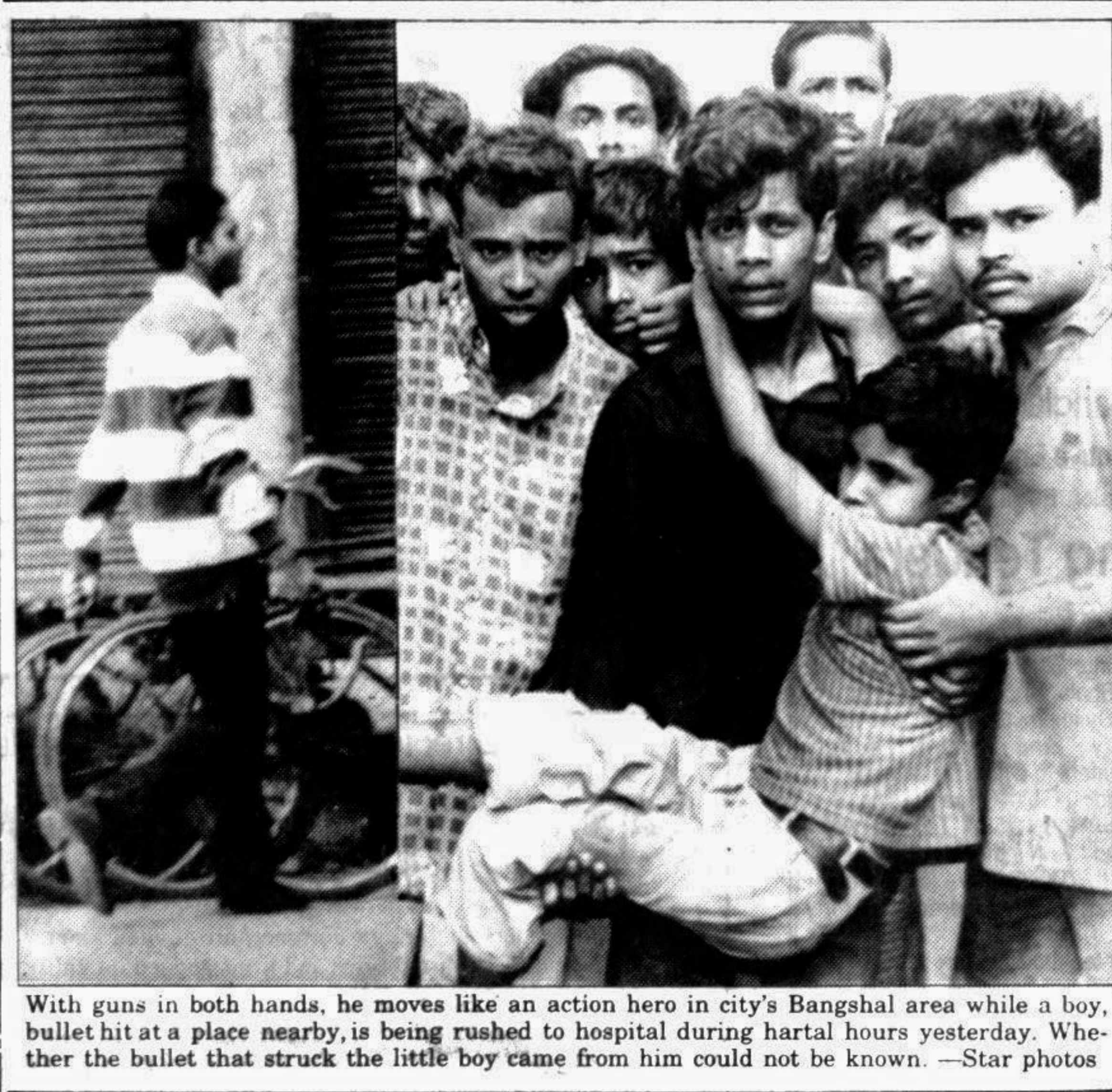
With guns in both hands, he moves like an action hero in city's Bangshal area while a boy, bullet hit at a place nearby, is being rushed to hospital during hartal hours yesterday. Whether the bullet that struck the little boy came from him could not be known.