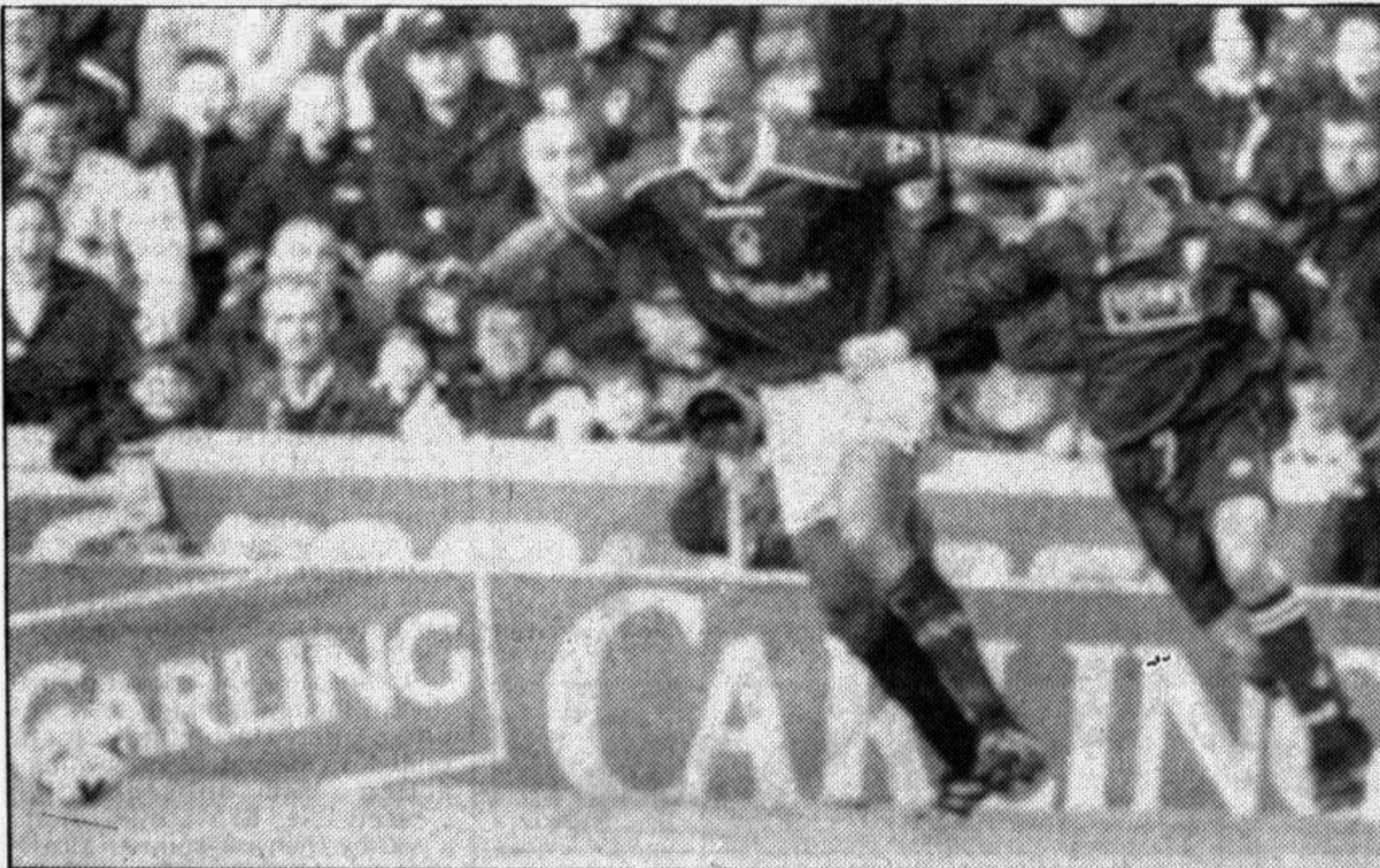
Nottingham Forest's Dutch international Pierre van Hooijdonk (L) being chased by a Wimbledon player during their Premiership encounter on Nov 7.

CRYPTOQUIP: B S C K S D B N Q A D D A O I B N M Q U L N M C U A J D C Z L H T K A O D H C J L D S A K N Q U A I D N Z H Q Q C K. Saturday's Cryptoquip: I'M TOLD THAT THIS ROBBEBECAMEANACTOR: HE WANTED TO STEAL THE SHOW. Today's Cryptoquip clue: K equals C. The Cryptoquip is a substitution cipher in which one letter stands for another. If you think that X equals O, it will equal O throughout the puzzle. Single letters, short words and words using an apostrophe give you clues to locating vowels. Solution is by trial and error.