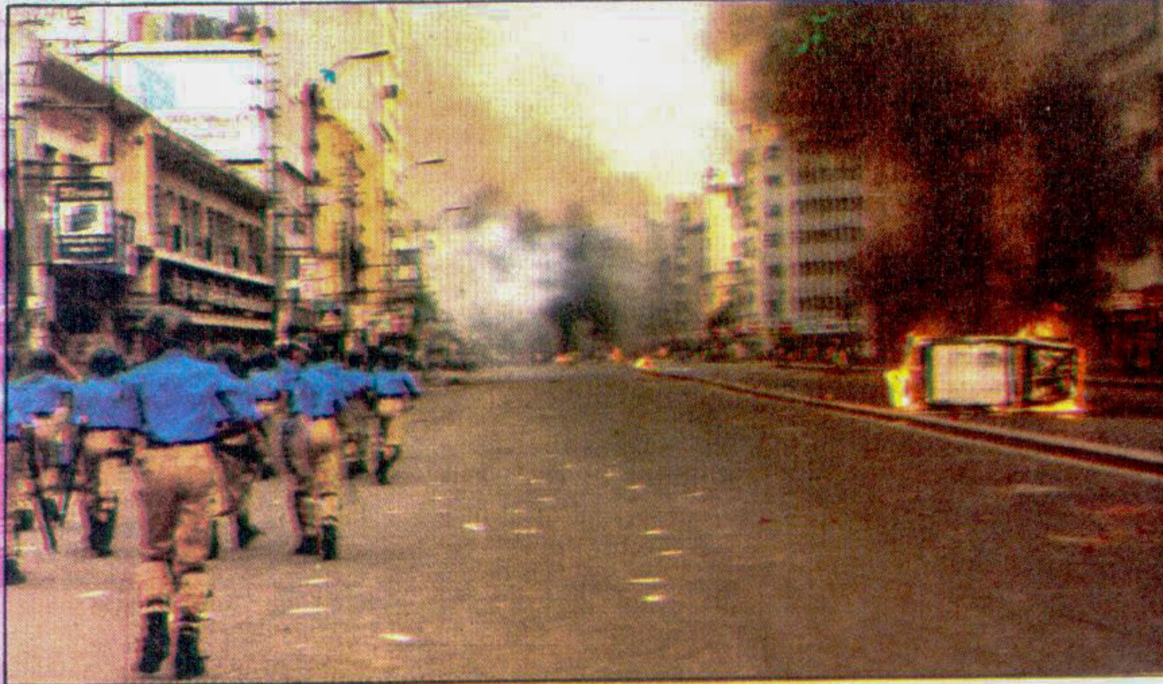
Police in riot gear move towards the Shapla Square as smoke from burning vehicles clouds the city's business district on a half holiday (left). It all stemmed from Paltan Maidan where angry activists began with this car parked just outside the meeting venue.