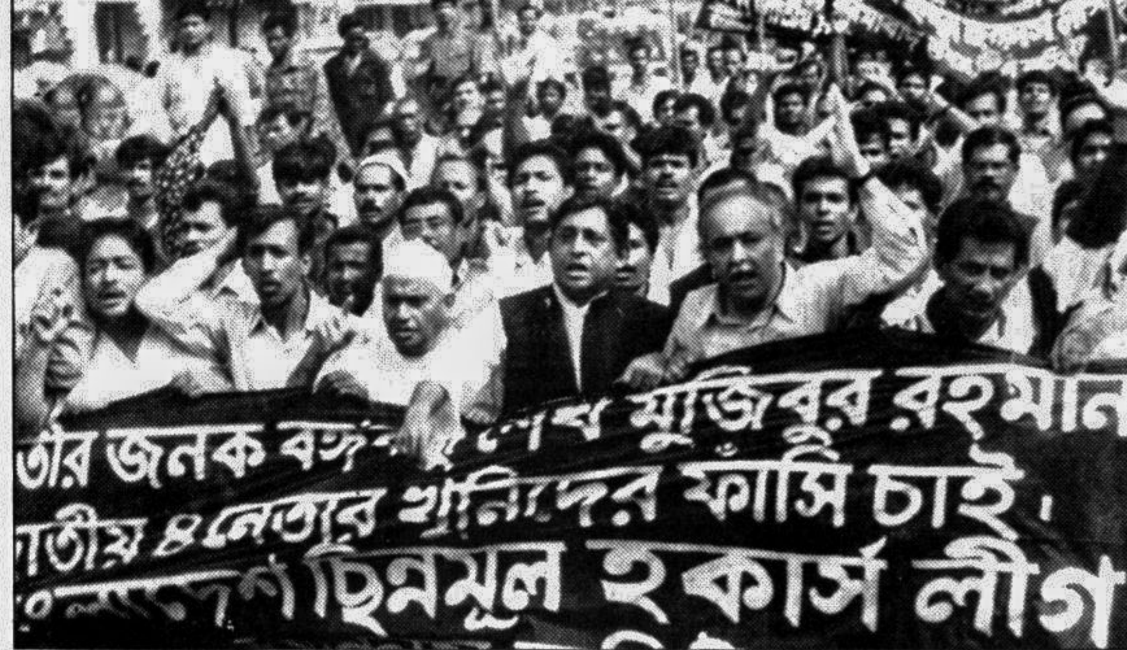
Hawkers League brought out a procession in the city yesterday demanding death sentence for the killers of Bangabandhu and four national leaders.

Our DU Correspondent adds: Panic gripped the Dhaka University campus and its surrounding areas yesterday afternoon as some vehicles carrying BNP supporters attacking the meeting venue under attack by the pro-AL Chhatra League (BCL) workers on the campus. The vehicles coming from Shahbagh were attacked by the BCL activists near TSC at around 4 pm. They beat up some BNP workers who jumped off the vehicles in the face of sudden attack by brickbats. BCL activists in a procession then went to Shahbagh Crossing and took position there. They obstructed the vehicles carrying BNP supporters and attacked some processions.