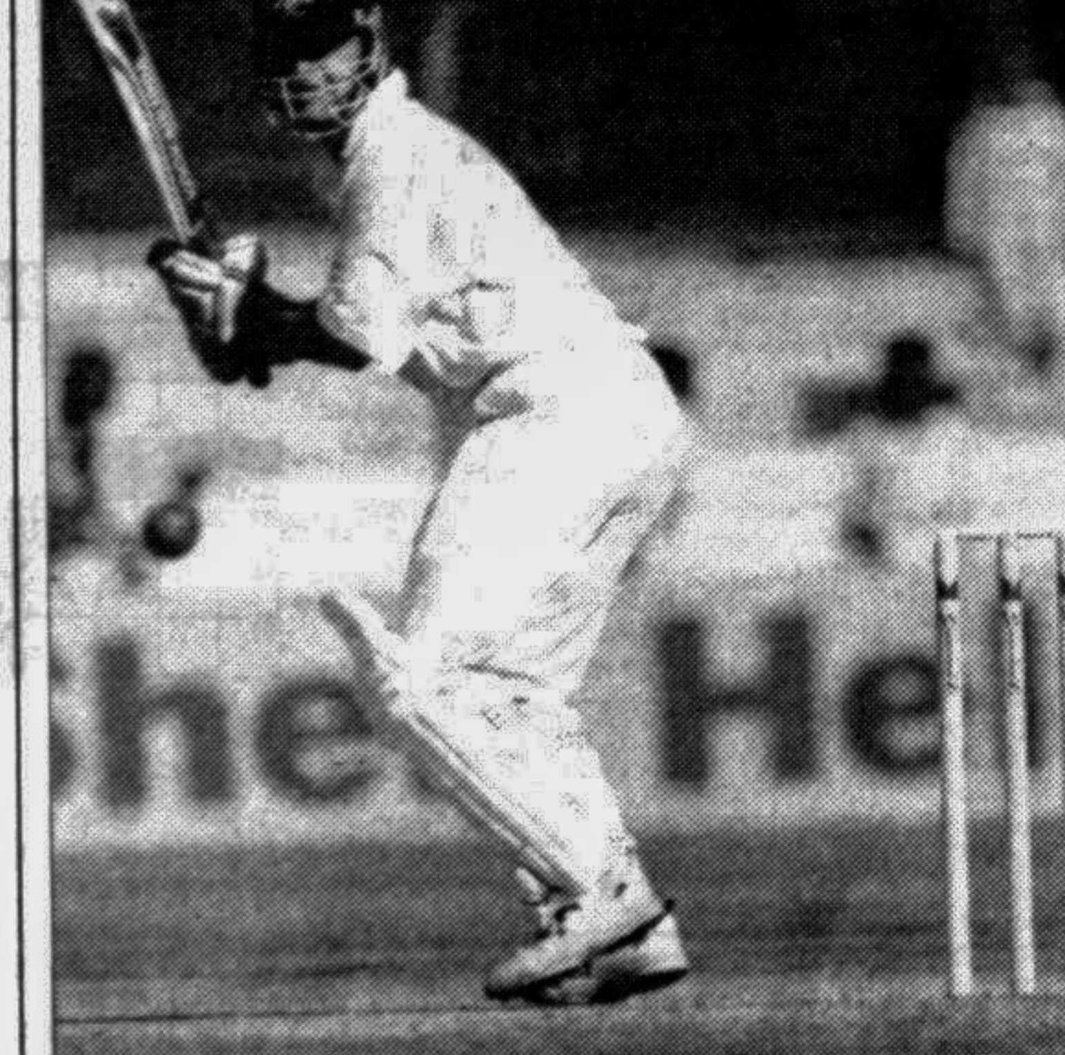
Adam Gilchrist, the Australian opener edges one towards the slips during the first one-day international against Pakistan in Karachi yesterday.