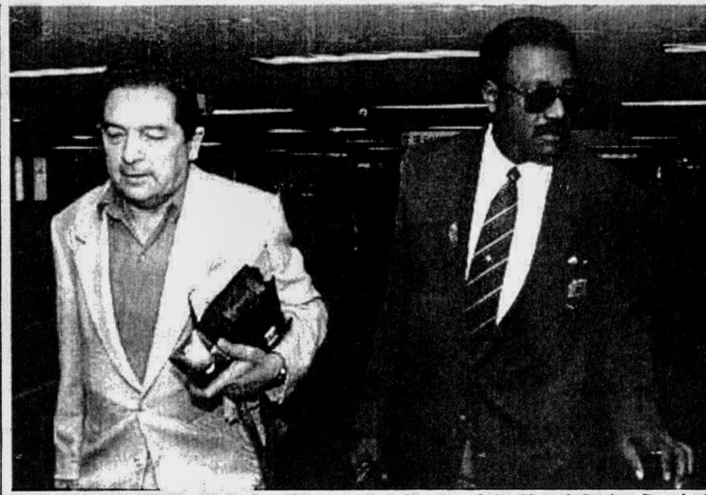
THE NEGOTIATORS: Ali Bacher (L), managing director of the United Cricket Board of South Africa (UCBSA), and West Indies team manager Clive Lloyd on arrival at Heathrow Airport in London yesterday. The two are hoping to bring an end to the players' revolt led by Brian Lara.