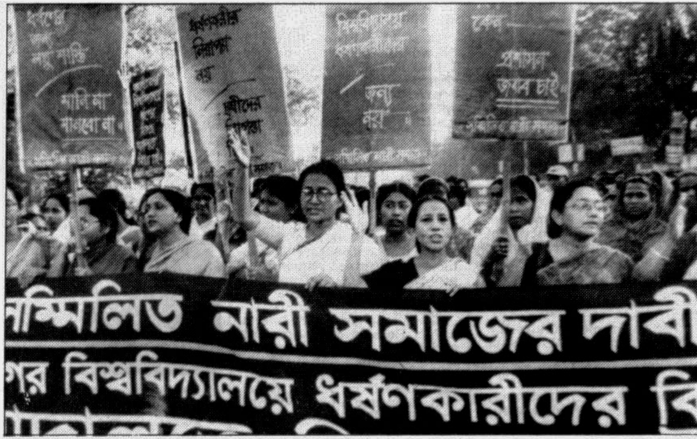
Sammilito Nari Samaj in a procession in the city yesterday demanding trial of those responsible for the incidents of rape at JU.