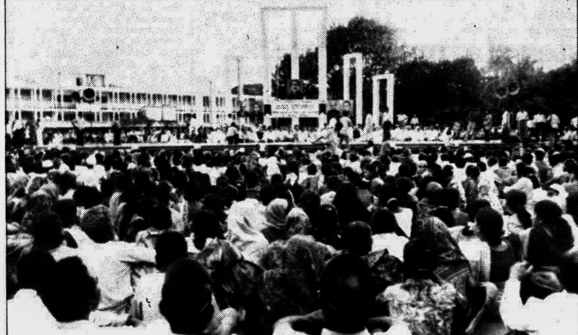
Bangabandhu Parishad held a rally at the Central Shaheed Minar in the city yesterday demanding exemplary punishment to the killers of Bangabandhu and four national leaders.