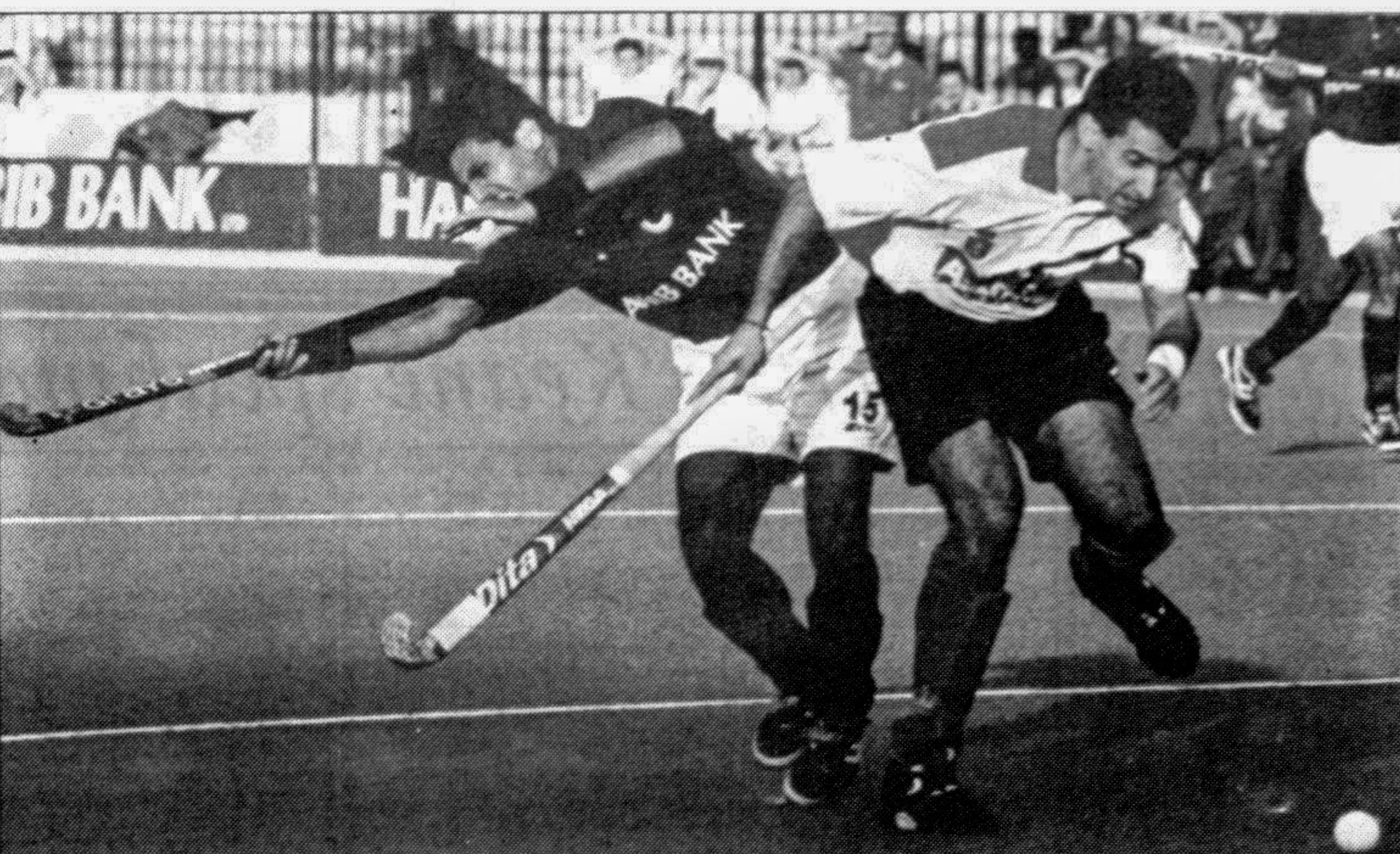
Action from the Champions' Trophy encounter between hosts Pakistan and Olympic silver medalists Spain on Nov 1. The game finished 2-2.

The day's other game saw Roda win 3-0 at FC Utrecht.