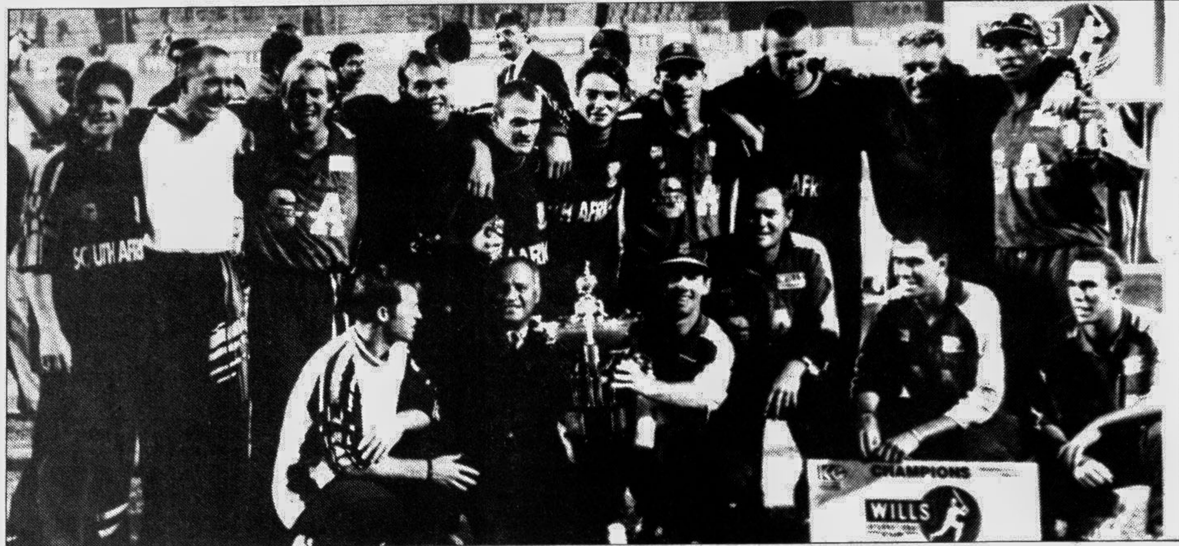
Players and officials of the victorious South African team with the Wills International Cup.