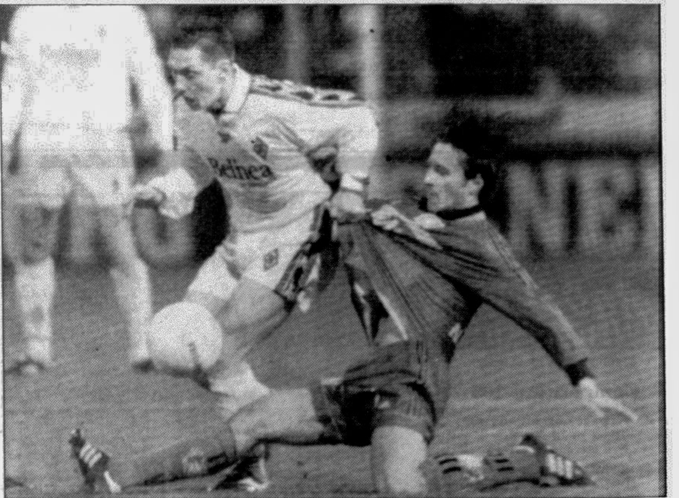
Borussia Moenchengladbach's Marcel Ketelaer (L) and Nico Kovac of Bayer Leverkusen are in quest of the ball during their Bundesliga clash in Moenchengladbach on October 30.