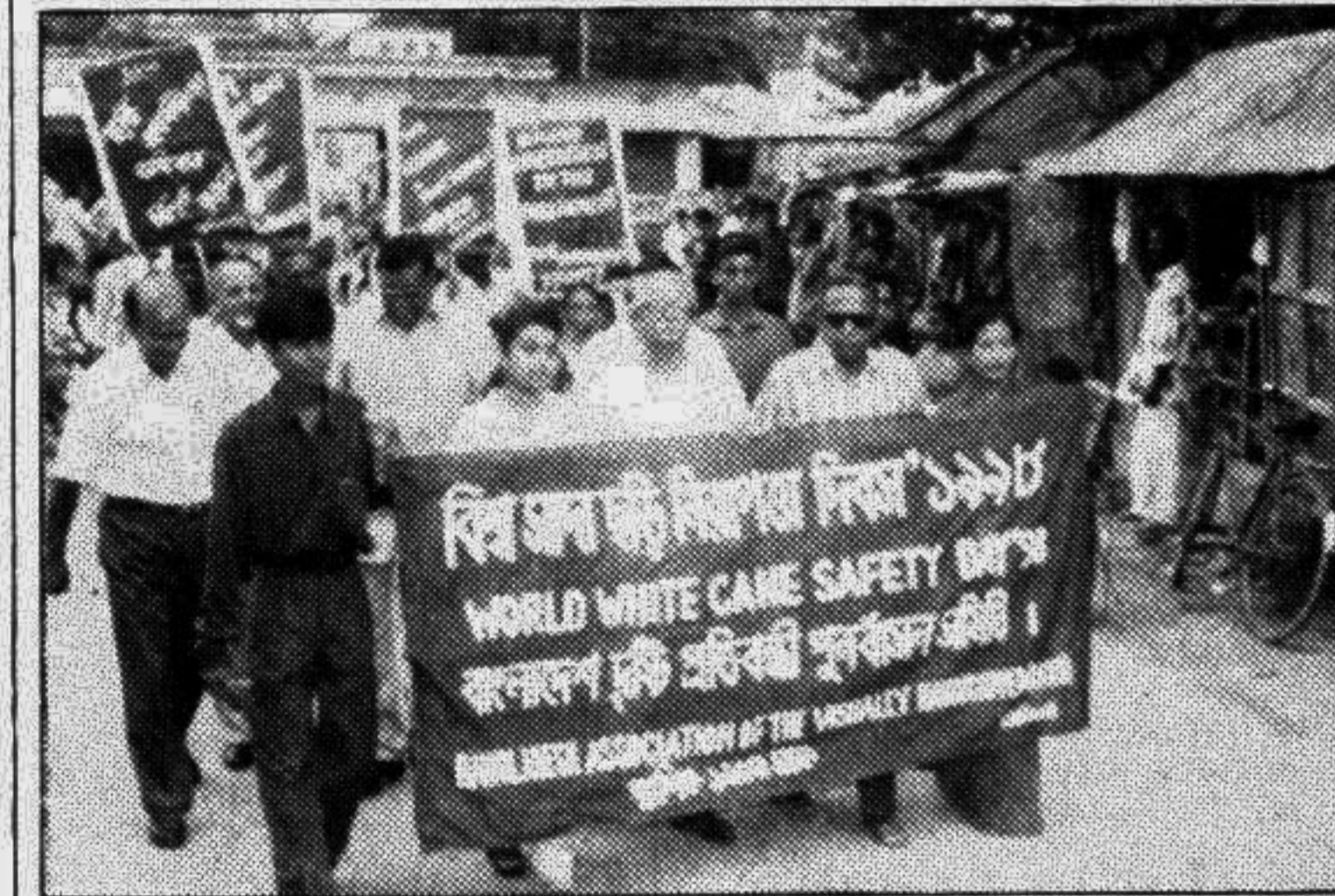
FARIDPUR: A rally was brought out in the town recently on the occasion of White Cane Safety Day.