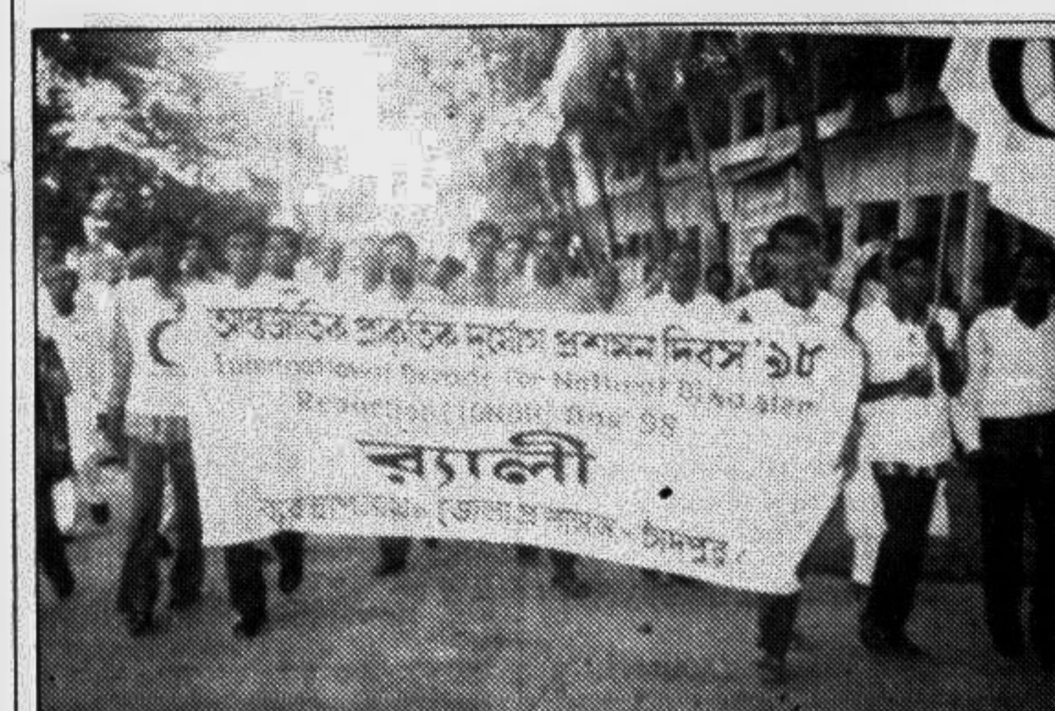
CHANDPUR: A colourful procession was brought out here recently on the occasion of Natural Disaster Reduction Day.