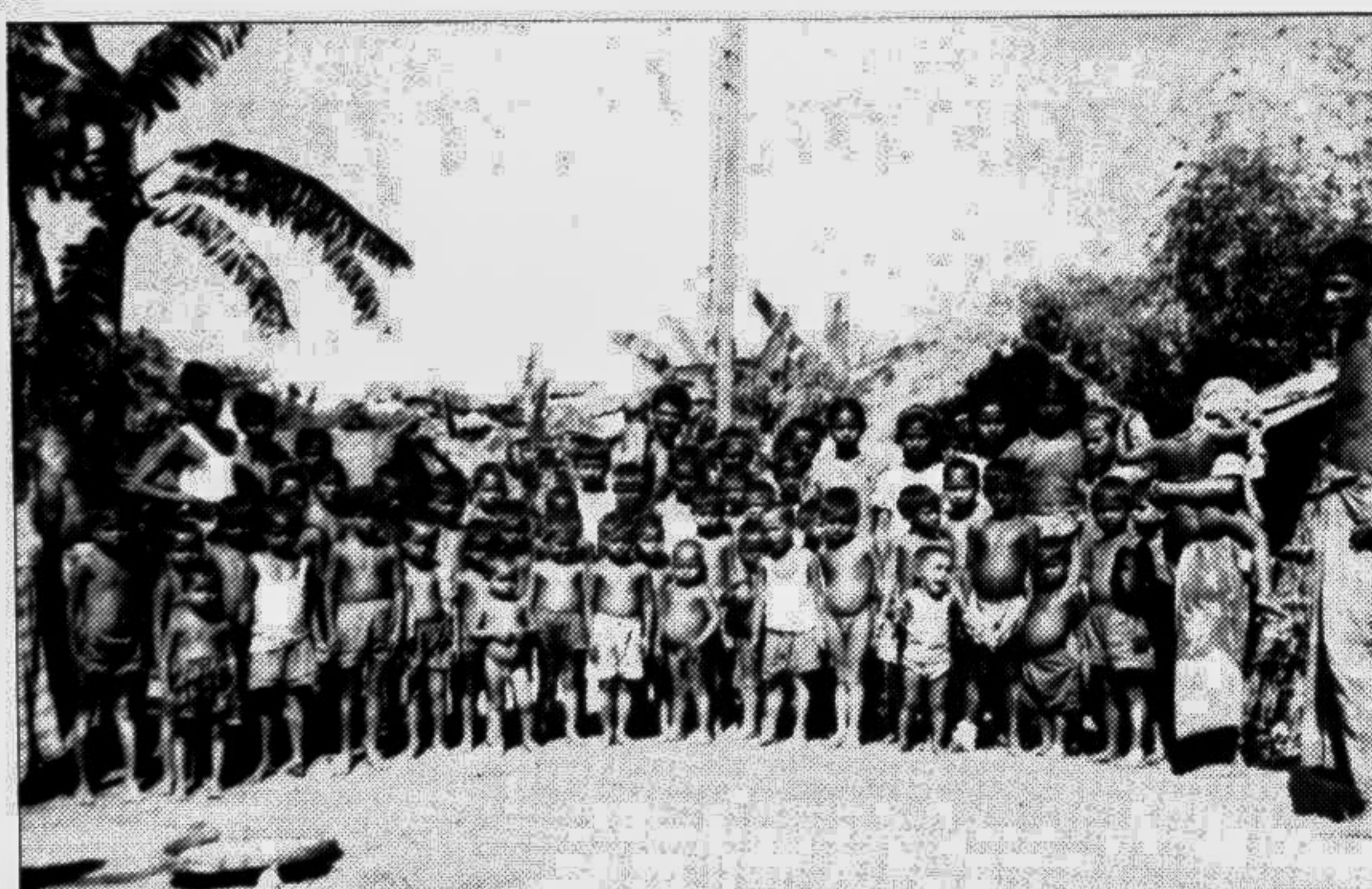
RANGPURA: A large number of boys and girls gathered recently on Teesta Flood Control Embankment at Gangachhara in the hope of relief goods.