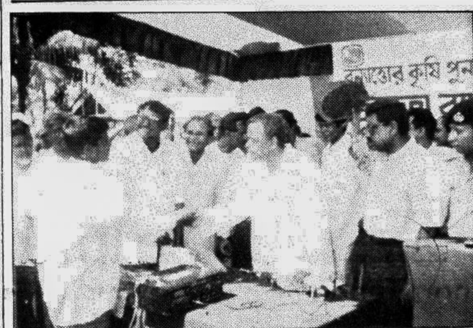
CHANDPUR: Mohiuddin Khan Alamgir, State Minister for Planning recently distributed agricultural loan of Janata Bank among the flood affected farmers of Palakhal in Kachua thana.

However, the university authorities are yet to receive any response from them. It is mentioned, Justice Shahabuddin Ahmed, President of Bangladesh has agreed to be present at the university on this occasion.