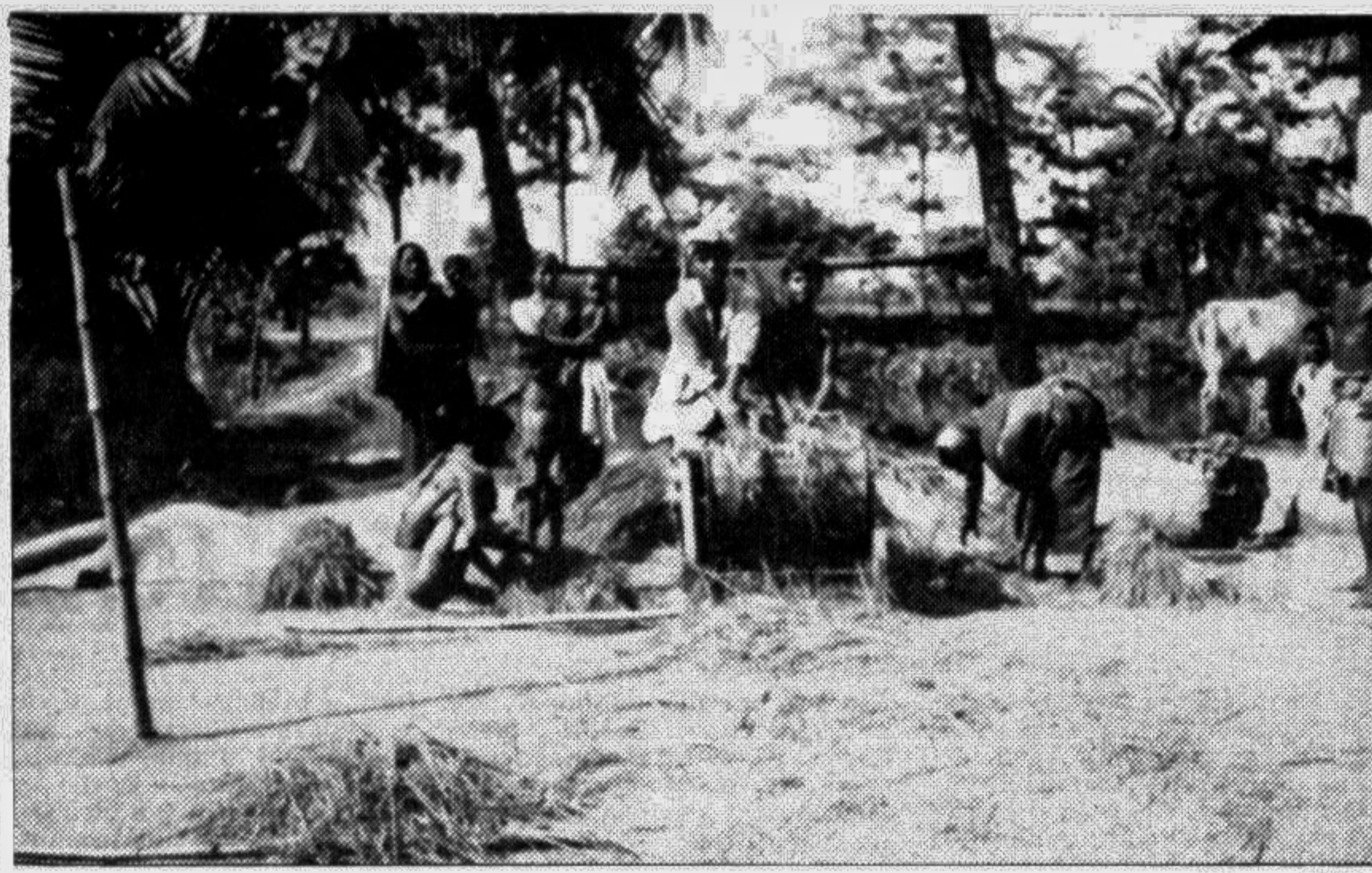
MAGURA: Straw crushing in progress following harvesting of early variety of 'Aman' like Nayanmoni, IR-50, IT and Ratna.

The miscreants managed to escape after the dacoity. A case has been started, but no arrest has yet been reported, police said.