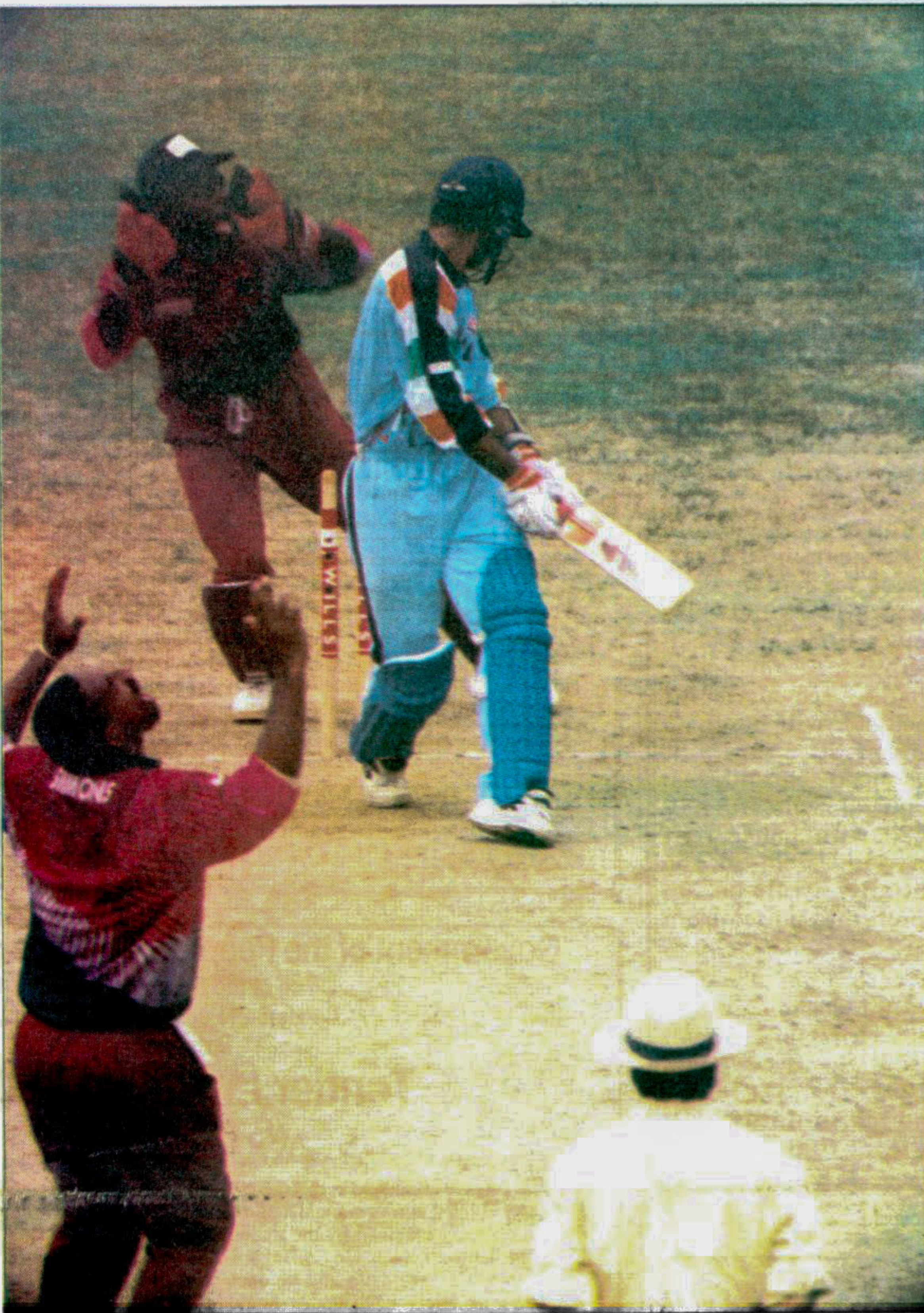
West Indian keeper Jacobs shouts in vain for a stumping against Rahul Dravid off Simmons Saturday.

A cool and collected Brian Charles Lara played an unconquered captain's innings as West Indies heralded the fall of India, the last of the three sub-continentals, to set up a date with formidable South Africa in the final of the Wills International Cup today.