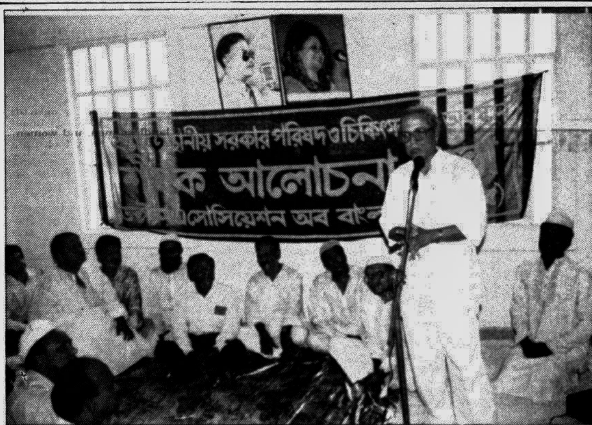
Deputy leader of the Opposition in Parliament Prof AQM Badruddoza Chowdhury addressing a discussion meeting at DAB office in the city yesterday.