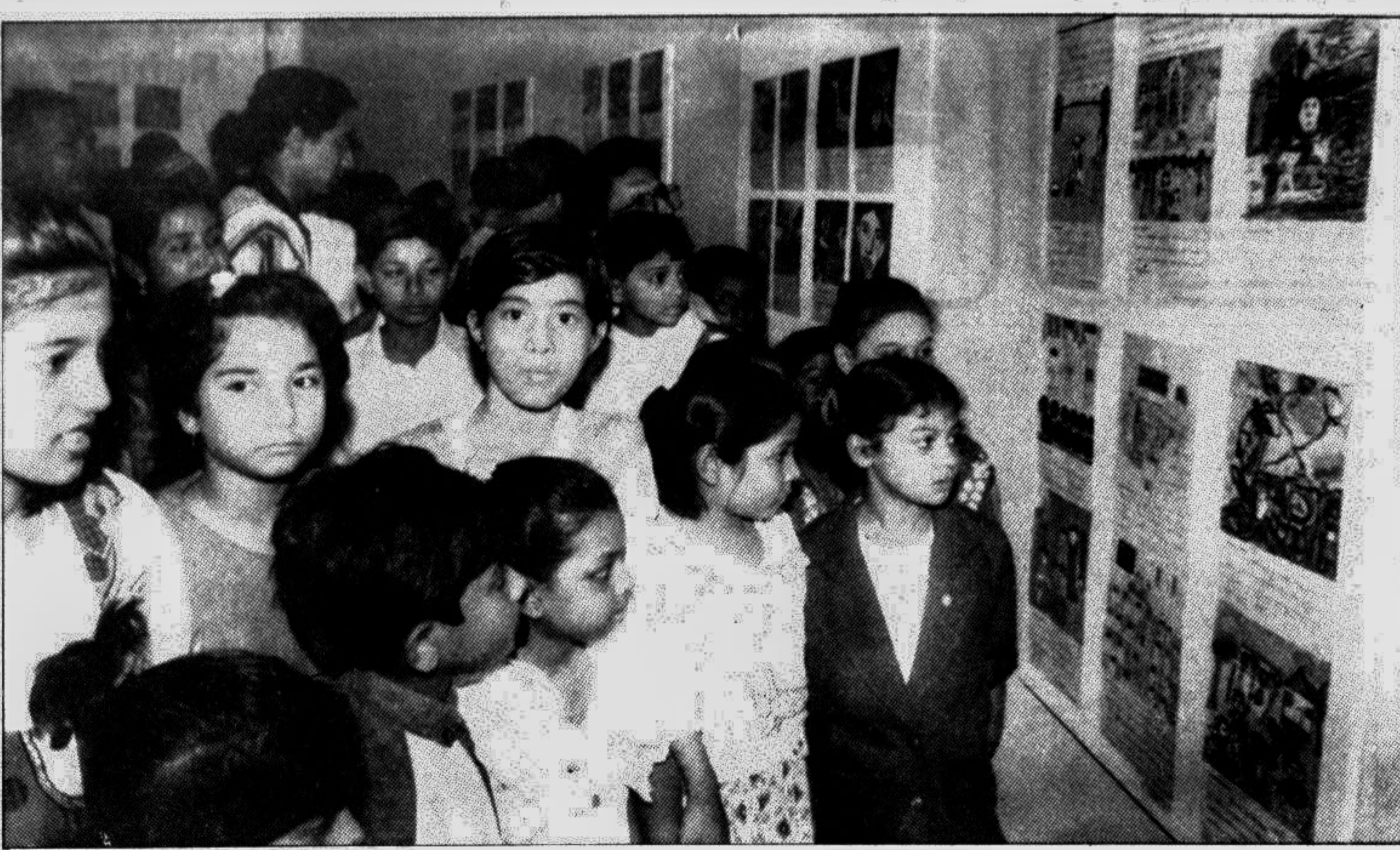
Visitors at the special exhibition of paintings by children that began at the Shilpakala Academy in the city yesterday. The exhibition will remain open till November 5. The paintings have been selected for the Asian Children's Painting Competition, scheduled to be held in Japan in March.