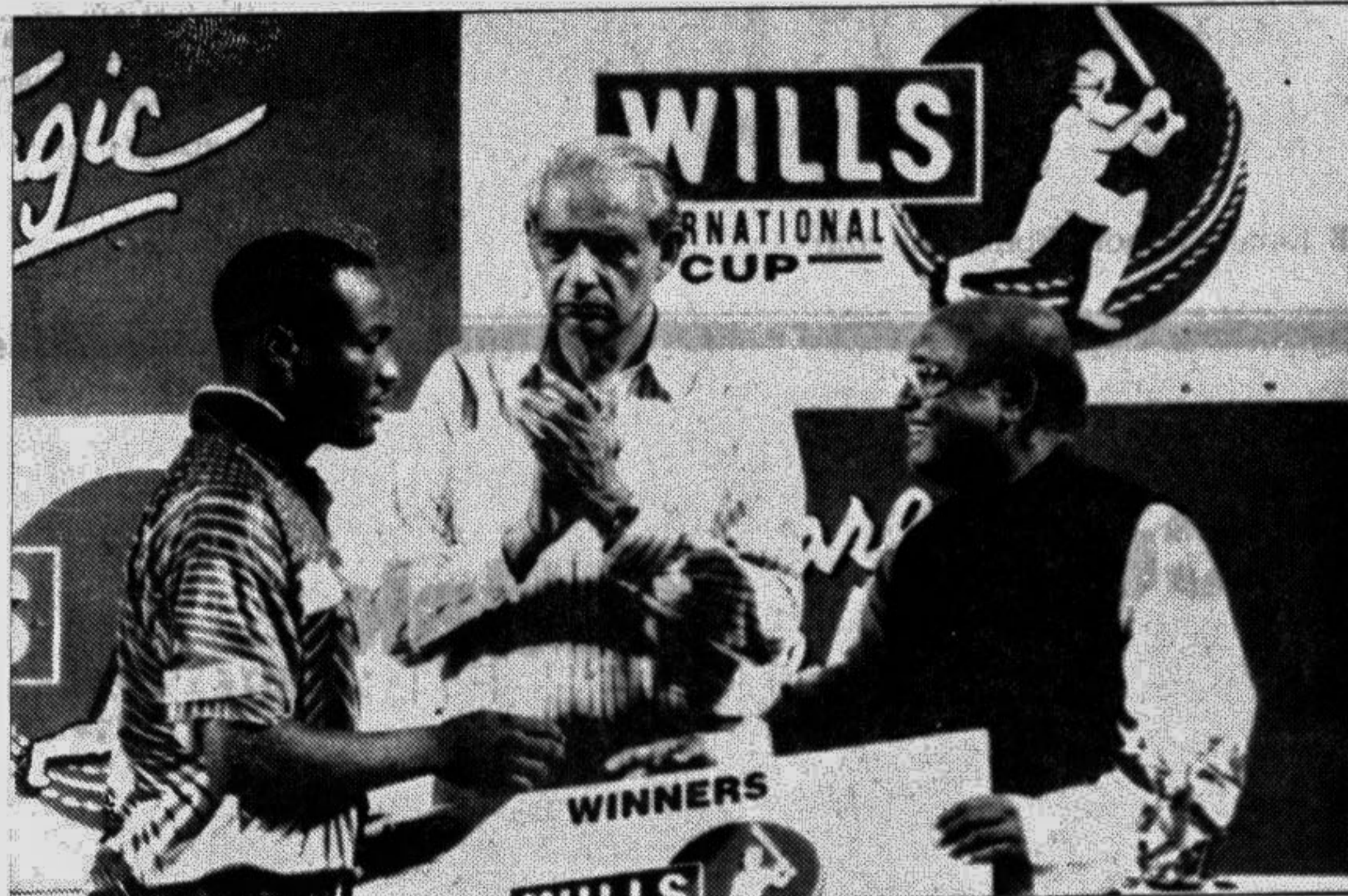
Brian Lara receiving the winners' cheque from Industries and Commerce Minister Tofail Ahmed.

Gough finished with two for 40 from 10 overs but it was Tudor, who returned figures of three for 62 in his first international appearance, who turned the game England's way.