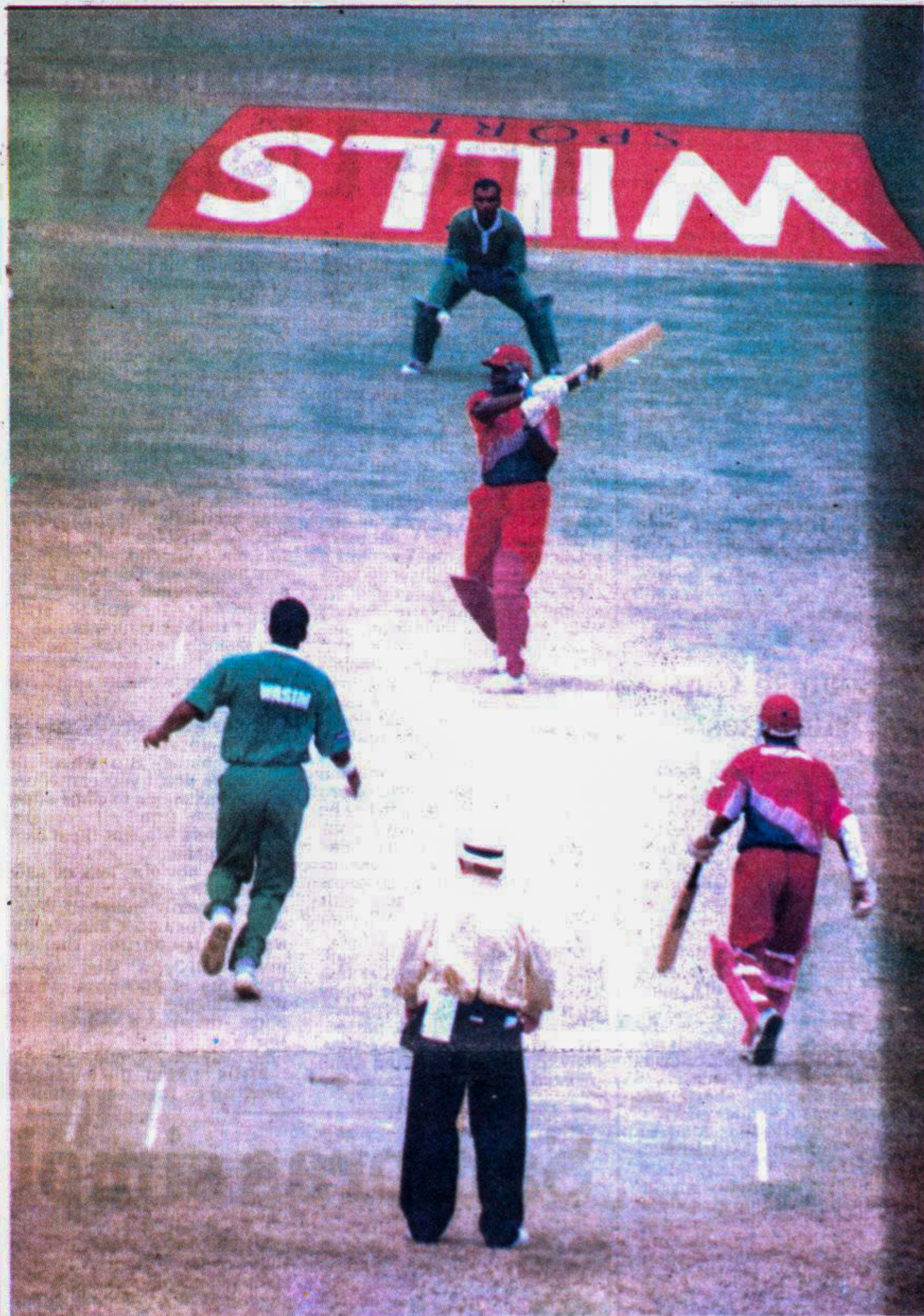
West Indies opener Philo Wallace square cuts Pakistan fast bowler Wasim Akram.

The closing date of The Daily Star-Standard Chartered Cricket Quiz '98 Round-2 has been extended up to Nov 2, '98.