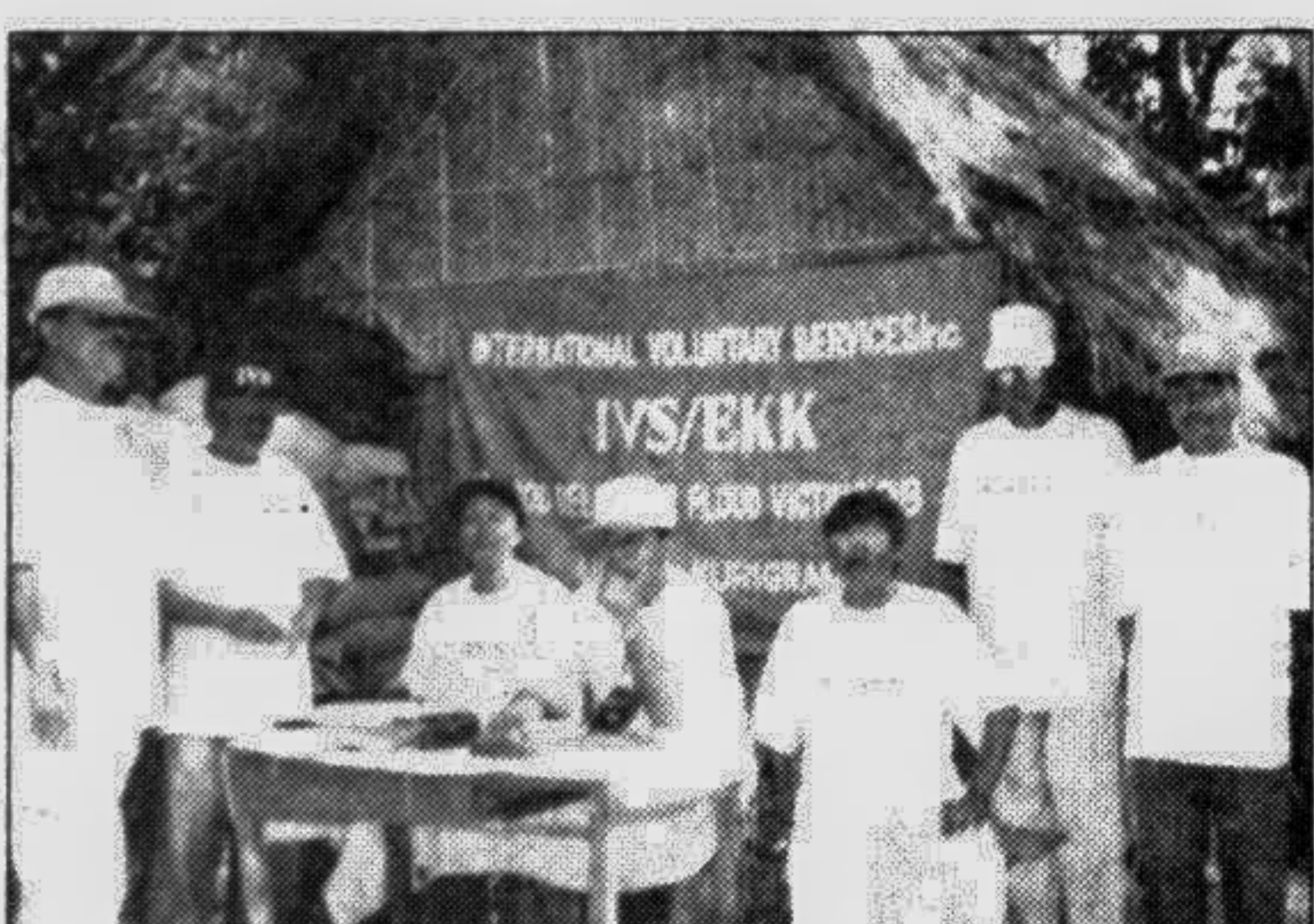
International Voluntary Services Inc (IVS) and Esho Kaj Kori (EKK) jointly distributed relief goods at Bazra Union under Ulipur Thana in Kurigram district recently. The operation was carried out under USAID funding. TNO of Ulipur Thana, Director EKK and IVS representatives were present.